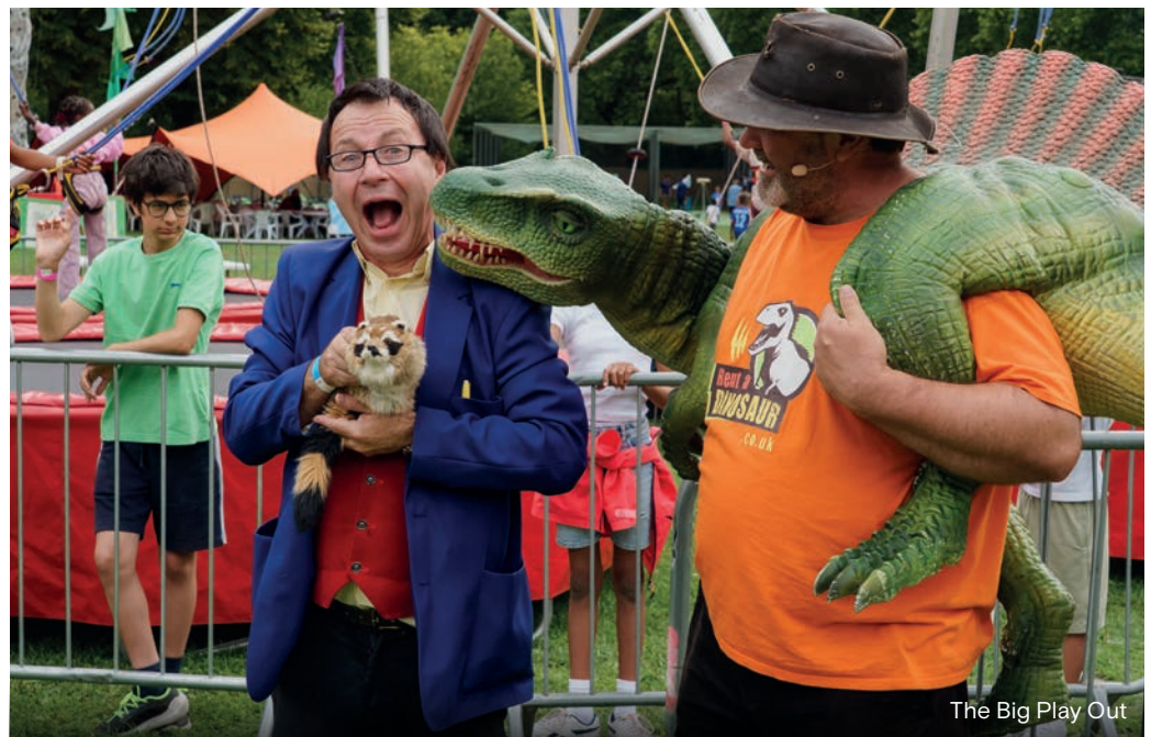
The Big Play Out