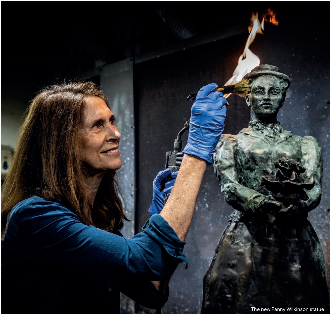
The new Fanny Wilkinson statue