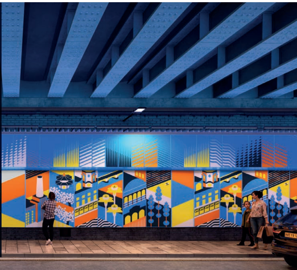
Artist's image of how the finished underpass will look

Find out more at wandsworth.gov.uk/falcon-road-bridge . If you have any questions email falconroadbridge@wandsworth.gov.uk