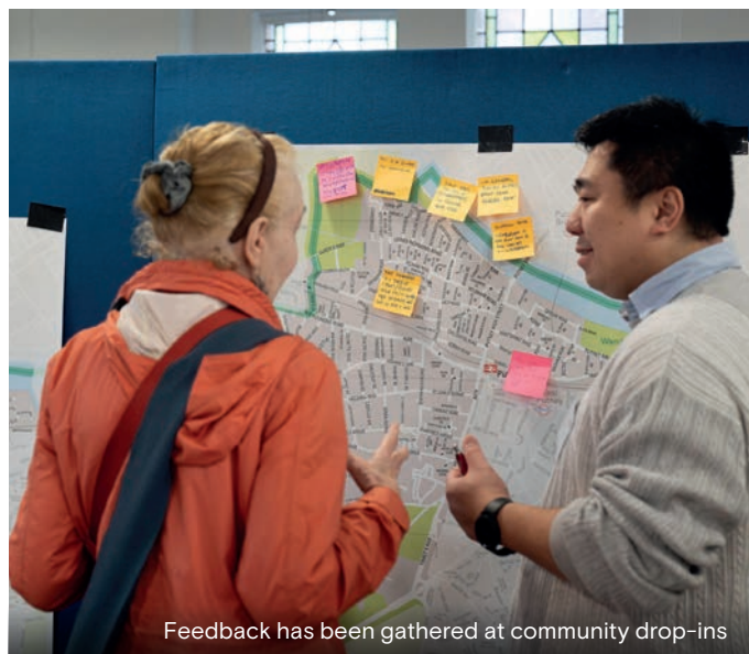
Feedback has been gathered at community drop-ins

These improvements are being funded by partners in the borough, acting on feedback from residents gathered at the council's community drop-in events and online surveys. Not a penny will be added to your council tax.