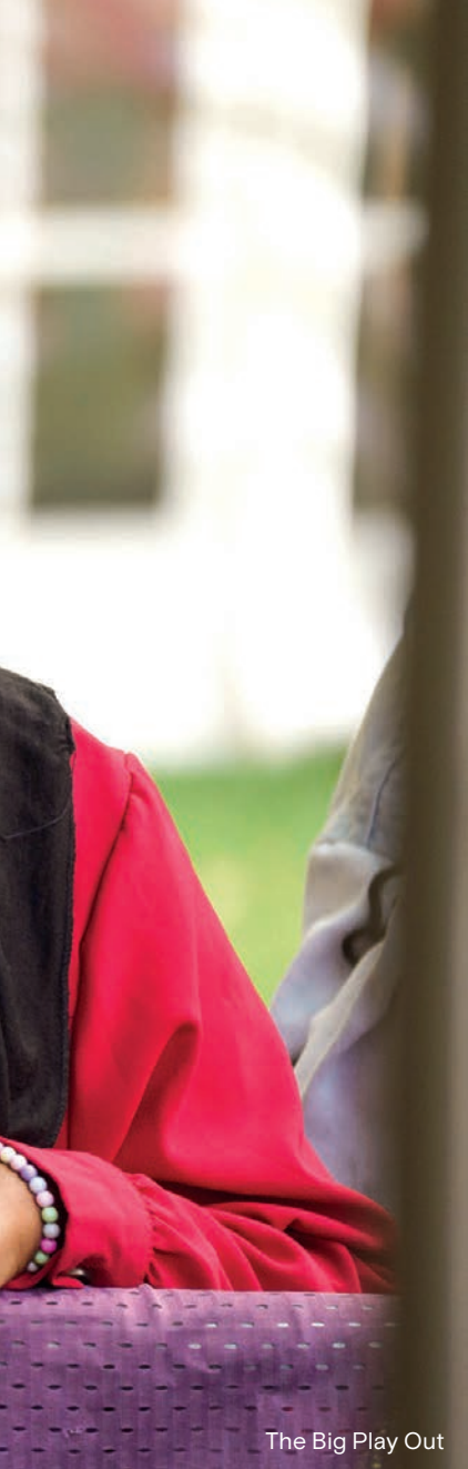
The Big Play Out