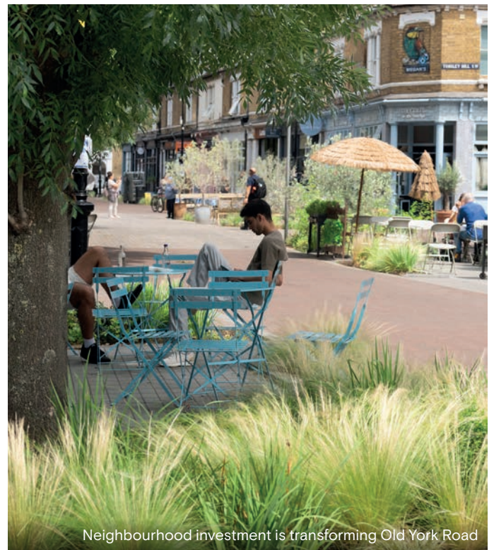
Neighbourhood investment is transforming Old York Road

improvingwandsworthtowncentre.commonplace.is