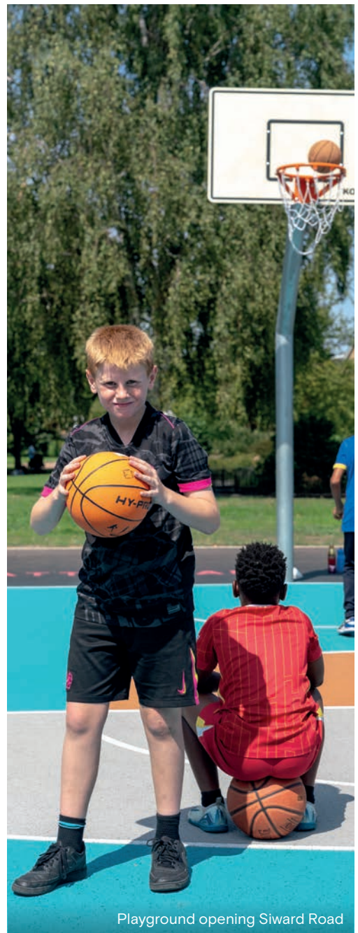
Playground opening Siward Road