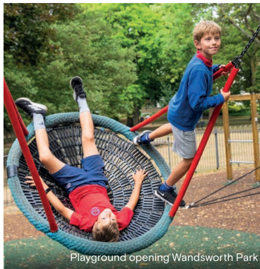
Playground opening Wandsworth Park