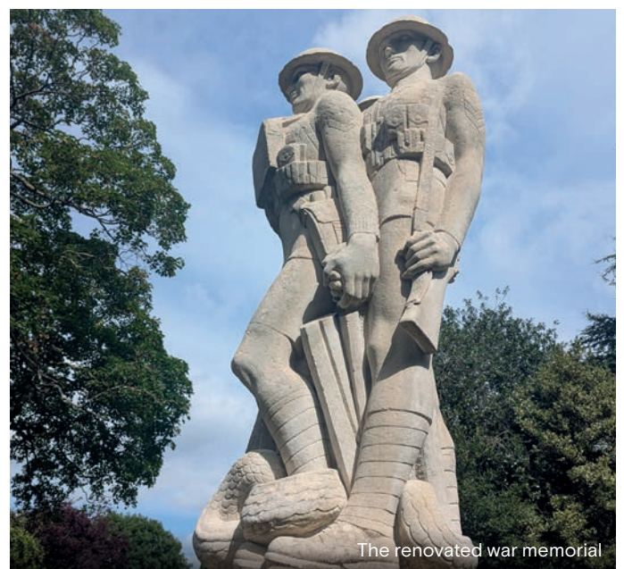
The renovated war memorial