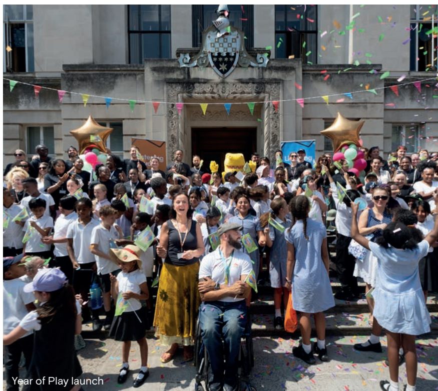
Year of Play launch