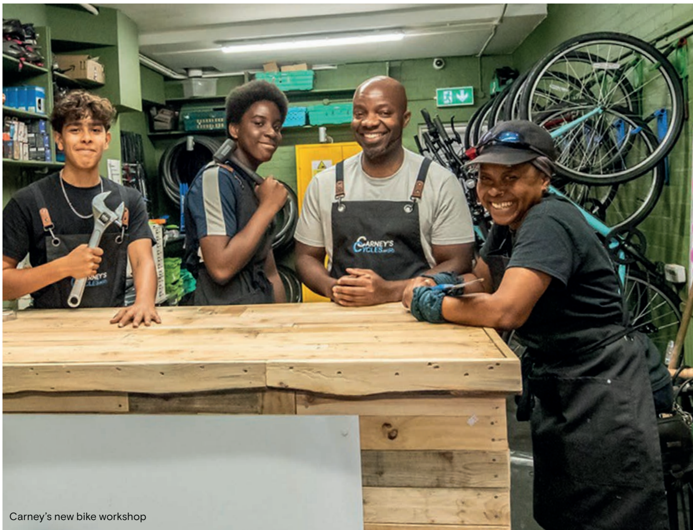
Carney's new bike workshop