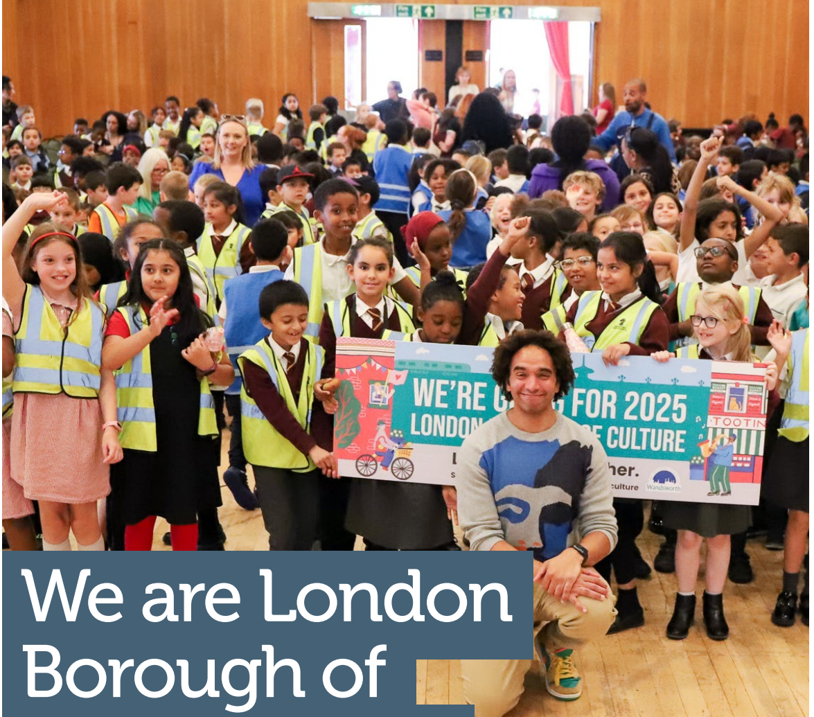
Children's Laureate Joseph Coelho backed our bid and is seen here with Year 4 children.