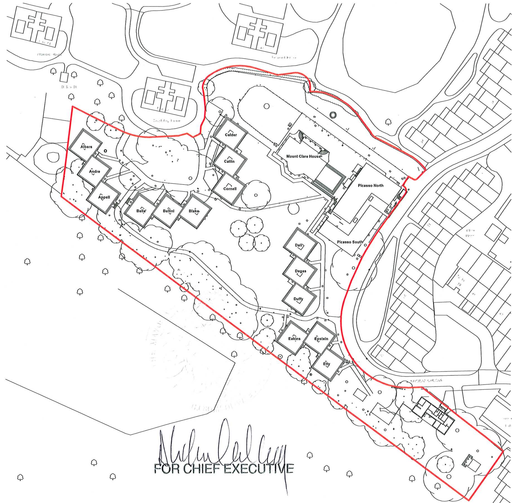
1 Proposed Site Plan 1:500

General Notes This drawing is copyright of KSR Architects. This drawing must be read in conjunction with the Design Brief, Assessment, Specification and all other relevant documentation and drawings. KSR Architects accept no liability for any errors, omissions or damage of whatever nature and however arising from any variation made to this drawing or in the execution of the work to which it relates which has not been referred to them and their approval obtained. Areas are based on uncheckered survey and are approximate only. Do not scale from this drawing or the digital data, only ground dimensions are to be used. Refer to the plan for further details. Check all dimensions on site prior to carrying out any works and advise any discrepancy.