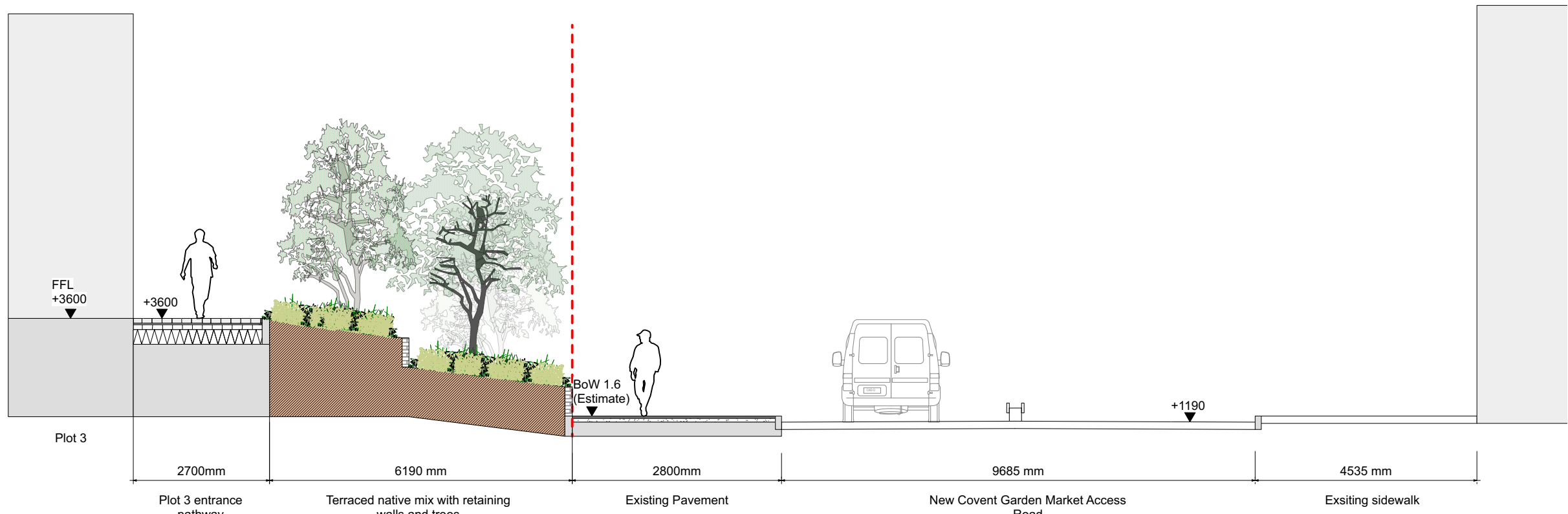
3 Section LL Scale: 1:100