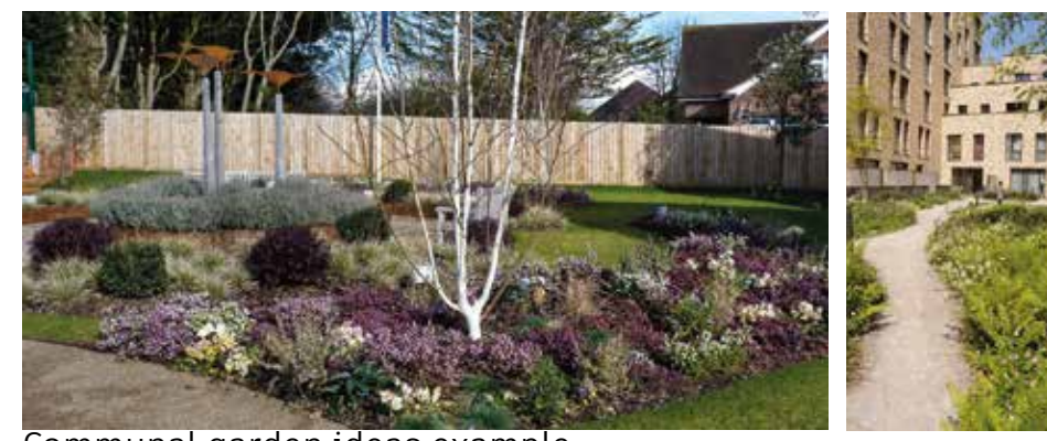
Communal garden ideas example.