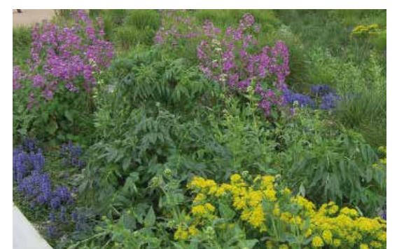
Soft landscaping example