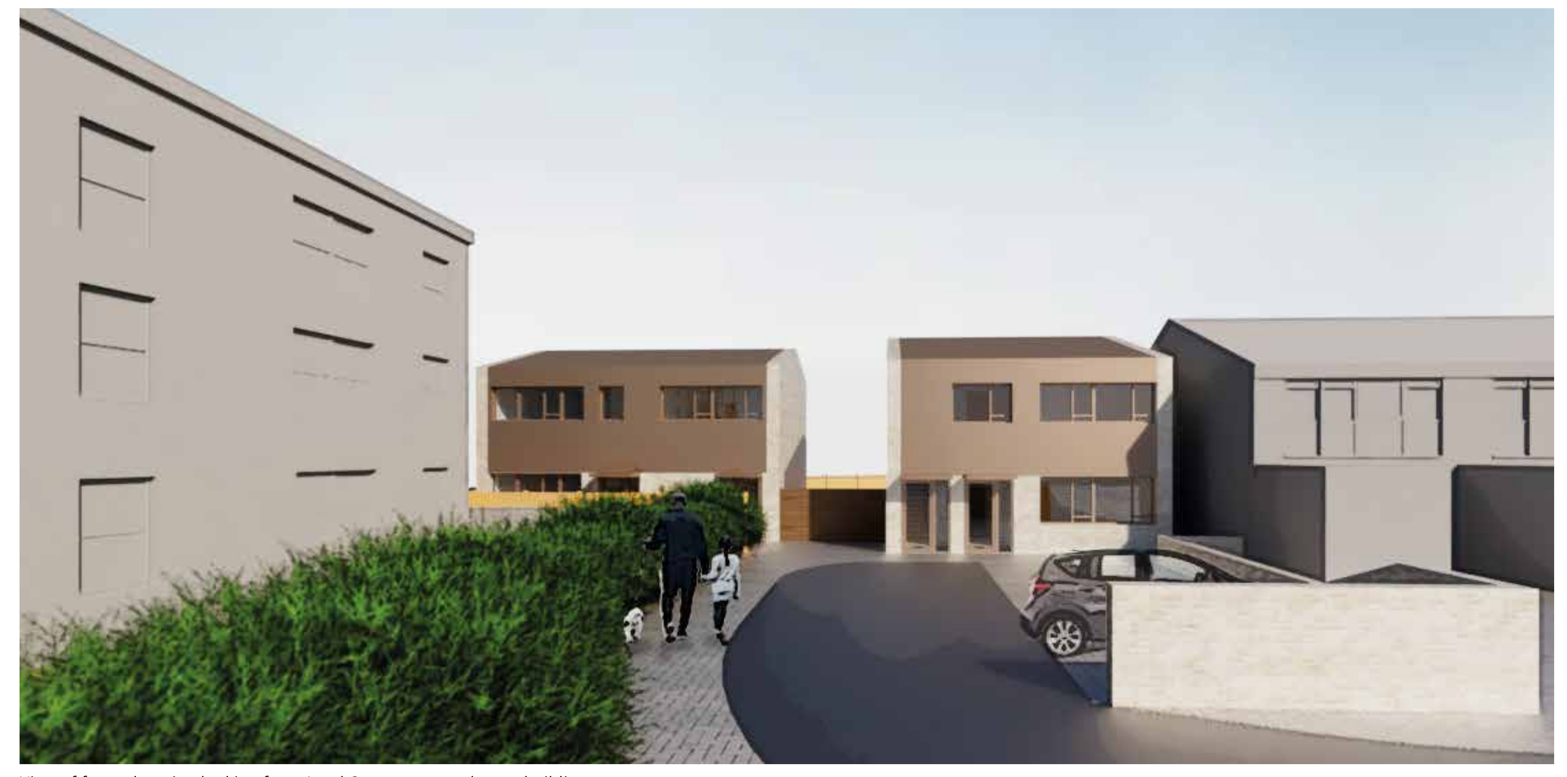
View of front elevation looking from Arnal Crescent towards new building.