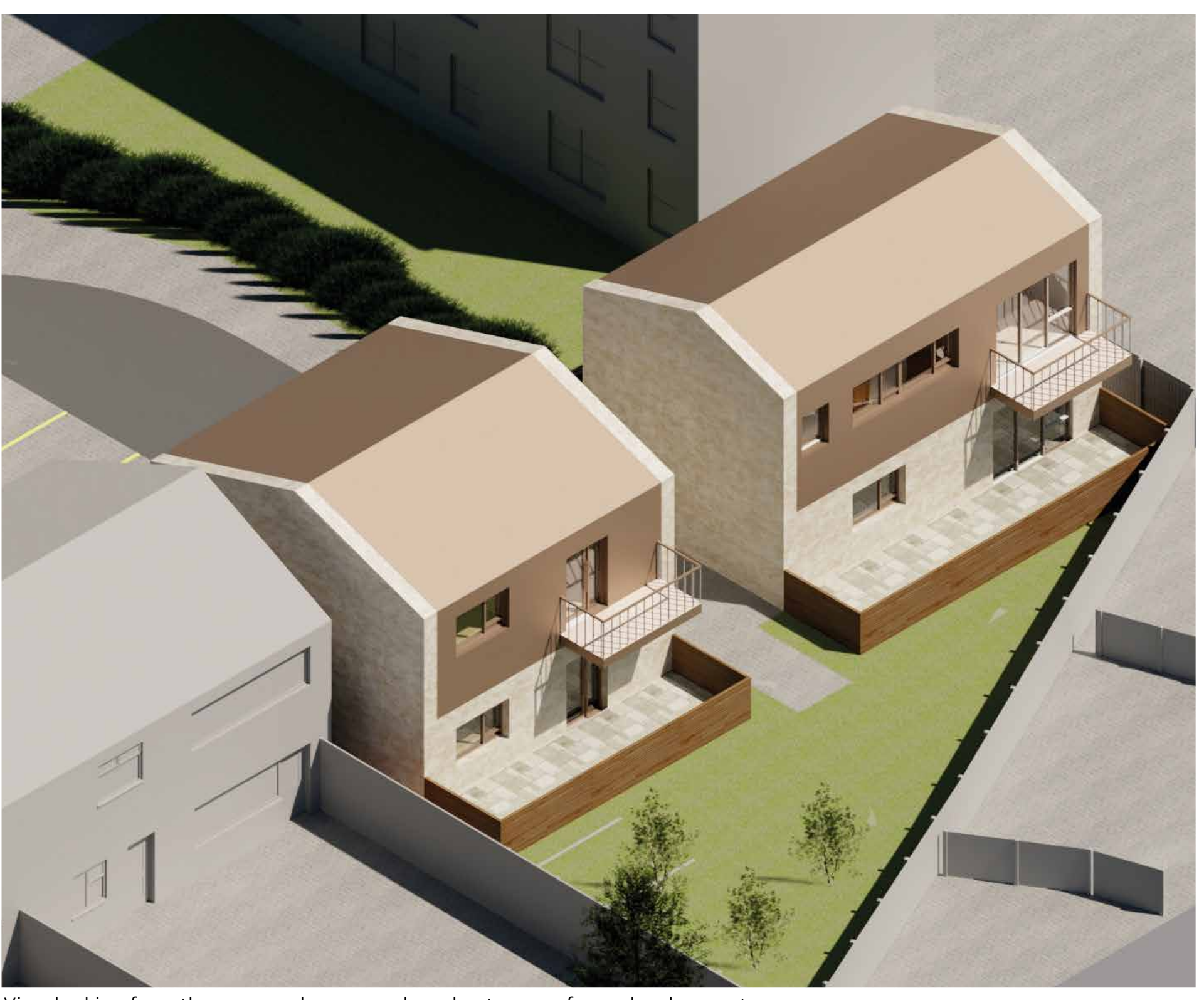
View looking from the proposed communal garden to rear of new development.