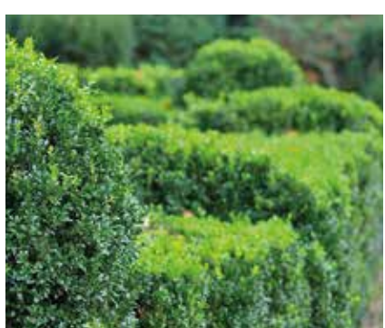
Soft landscaping example