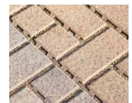
Hard landscaping example Hard landscaping example