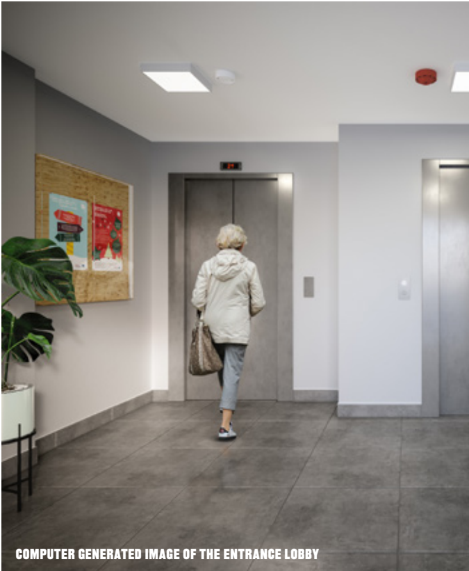
COMPUTER GENERATED IMAGE OF THE ENTRANCE LOBBY