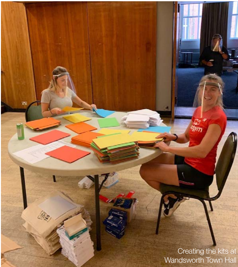
Creating the kits at Wandsworth Town Hall