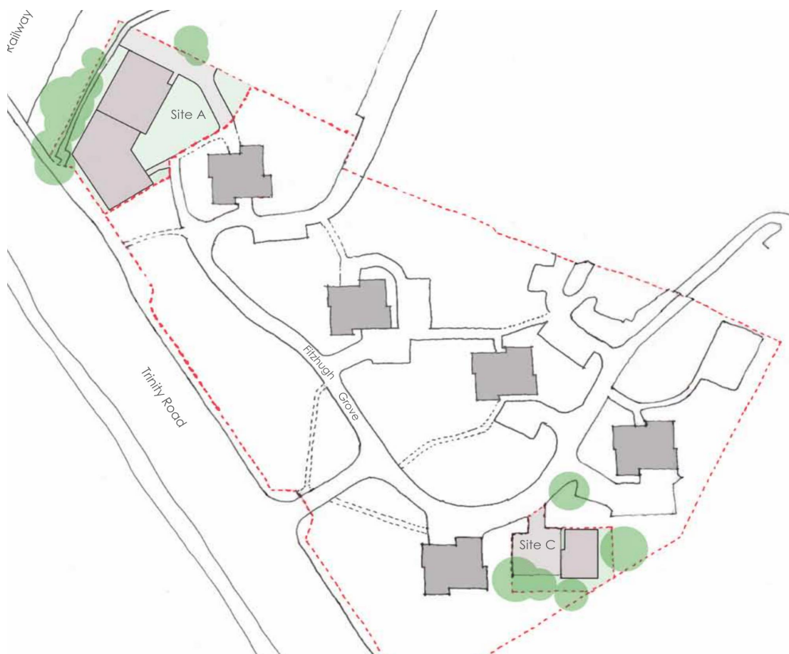
Current iteration of feasibility study Fitzhugh Estate site plan (as of 11 th Sept 2020)

Following on from our last letter, we have met with the Resident's Association in order to hear the views and feedback on our ongoing feasibility study from those living on the estate. A summary of what was discussed, related to the image below, is as follows: