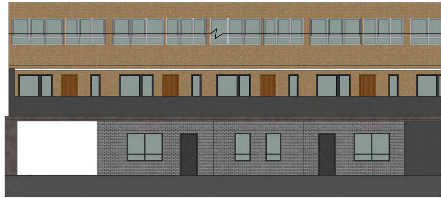
Elevation - east 1 : 100