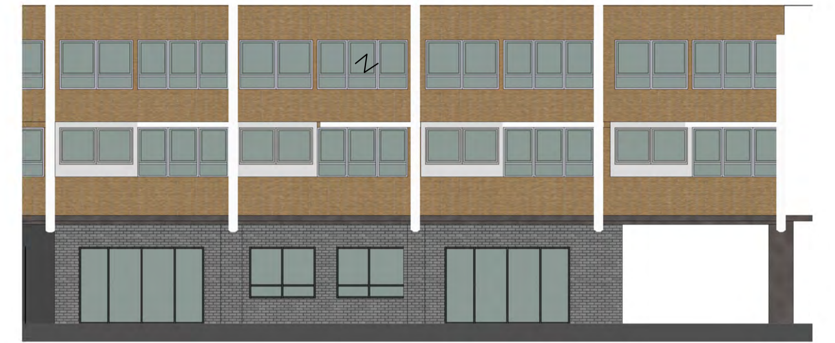
Elevation west 1 : 100