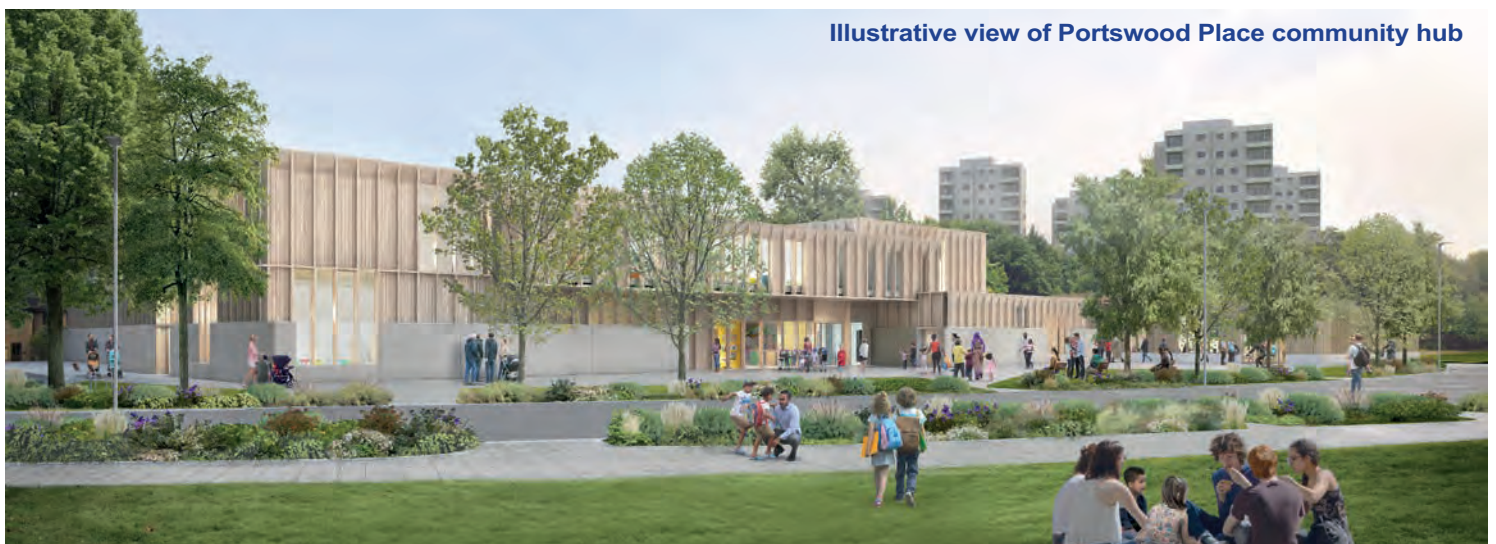
Illustrative view of Portswood Place community hub