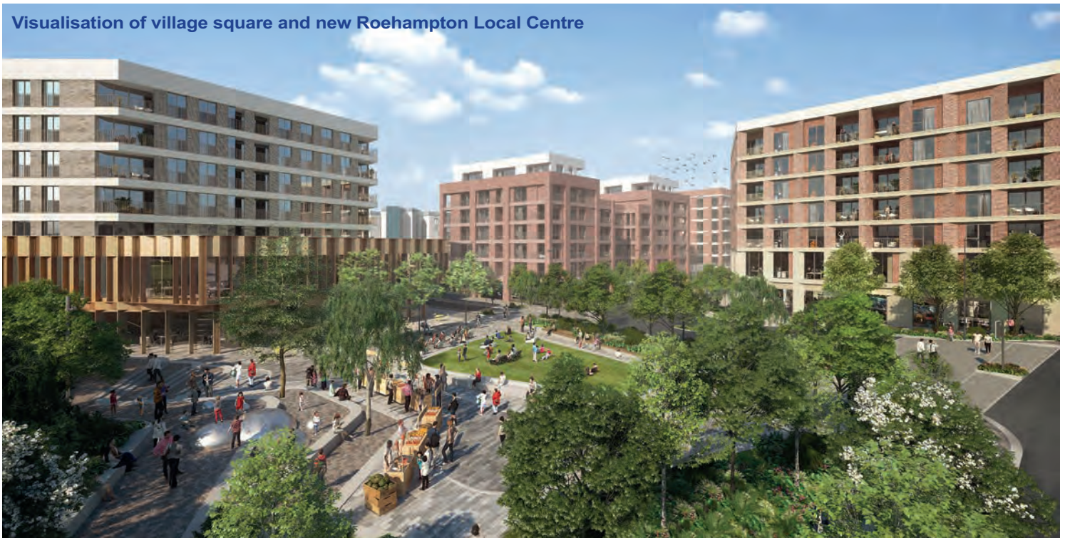
Visualisation of village square and new Roehampton Local Centre

The Council give notice that Redrow Homes Limited has applied to the Council for planning permission for the redevelopment of part of the Alton Estate in Roehampton as shown on the plan overleaf. The application is for a part outline and a part detailed planning permission for the following proposed development: