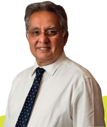
Ravi Govindia Council Leader

If you are unable to attend the meeting, you can still submit your questions to the council via the website www.wandsworth.gov.uk/letstalk .