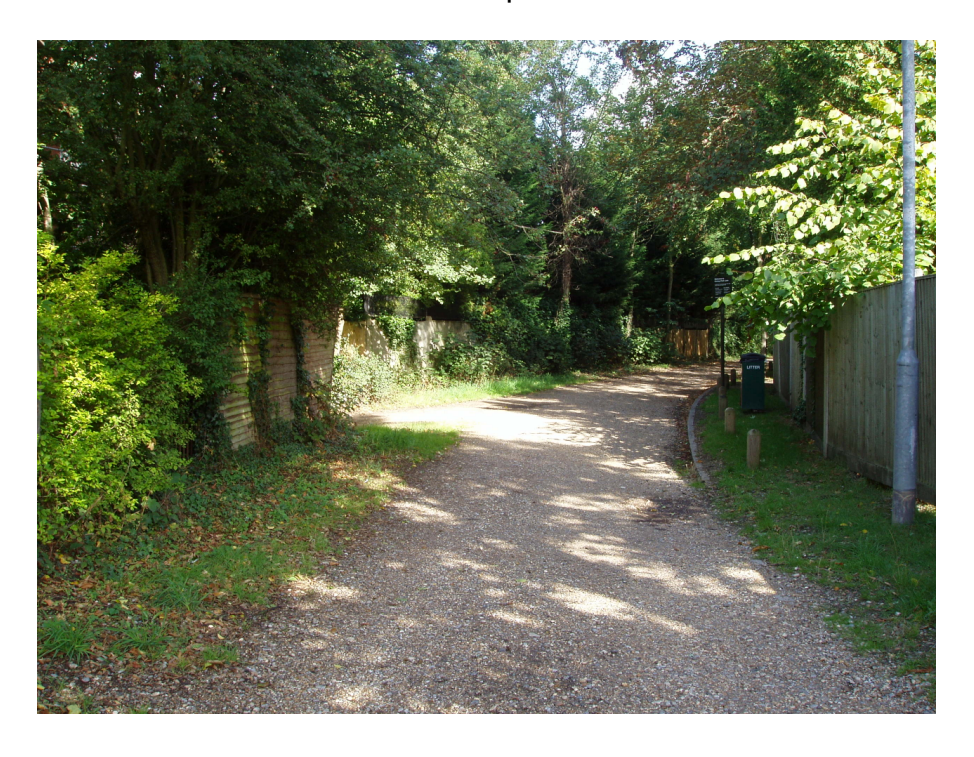
Index Timetable Site description Current management Future management Action plan