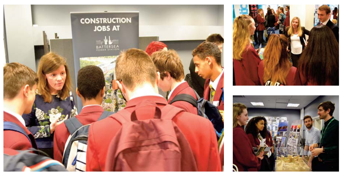
Students find out about construction work in Nine Elms at a jobs fair run by Wandsworth Council at South Thames College