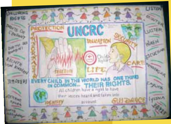
Ark Academy Putney winning poster design