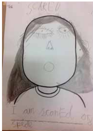
The picture shows work by a pupil in Year 1 at All Saint's School, Putney who is learning to recognise different emotions.

Find out more about PATHS at www.pathseducation.co.uk .