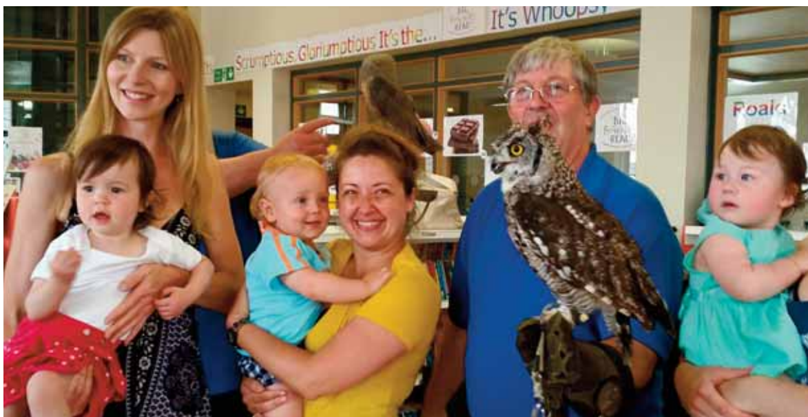
Crunchy the Owl visits Tooting Library