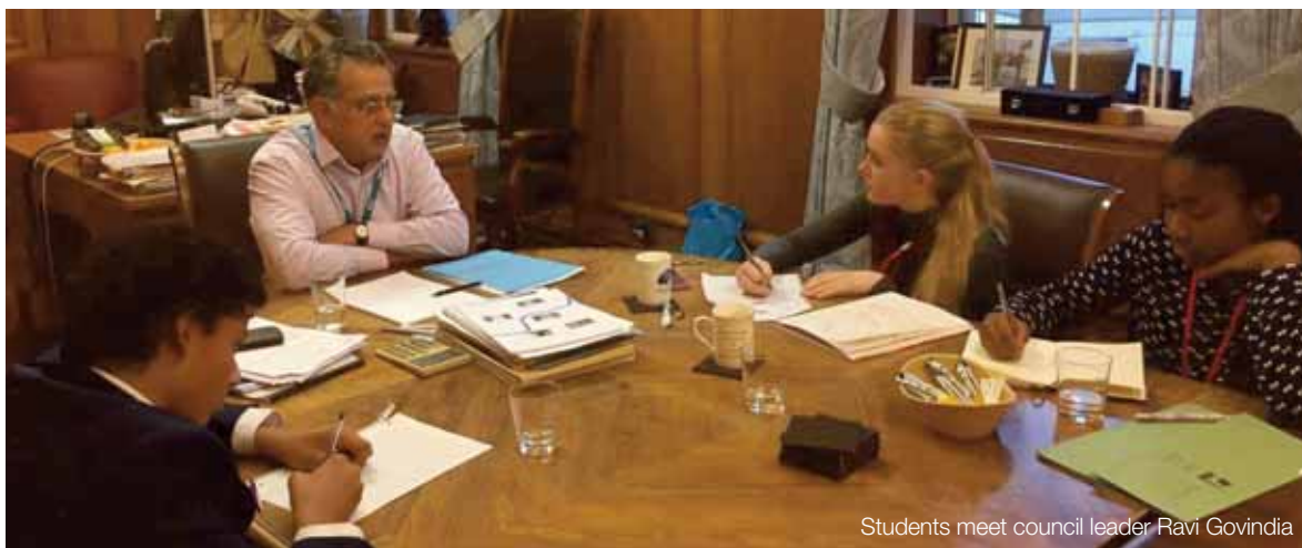
Students meet council leader Ravi Govindia