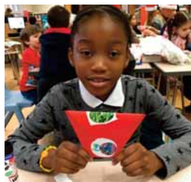
Local environmental group Transition Town Tooting held a sustainable arts workshop at Tooting Library

Find out what's on at your local library at www.better.org.uk/library/london/wandsworth .