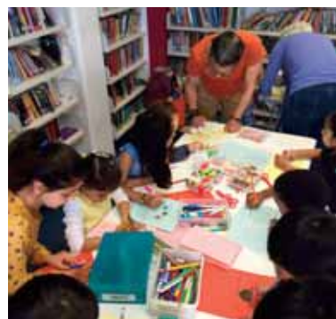
An Eid-themed story time at Balham Library