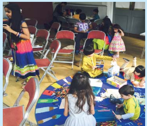
Eid event festivities at Balham library