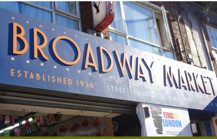
Broadway Market in Tooting - a truly eclectic and historical London market

Broadway Market in Tooting is one of London's oldest markets. With over 100 stalls selling food, drinks, groceries, clothes, electronics, homewares and so much more, you're sure to find everything you need under one roof. 29 Tooting High Street, London, SW17 ORJ T: 020 8672 6613 W: www.bmtooting.co.uk