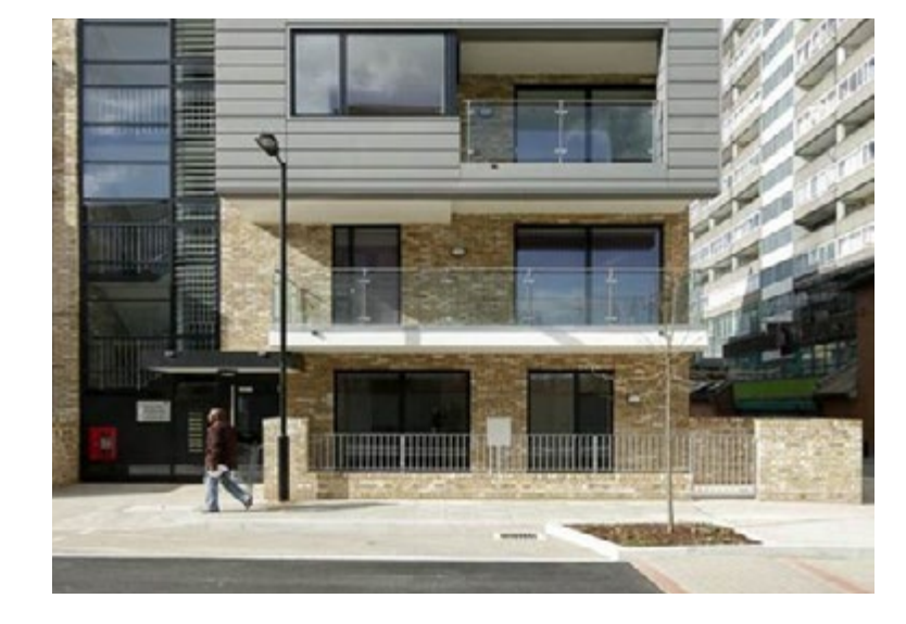
Well lit entrances with no steps and lift access to all homes