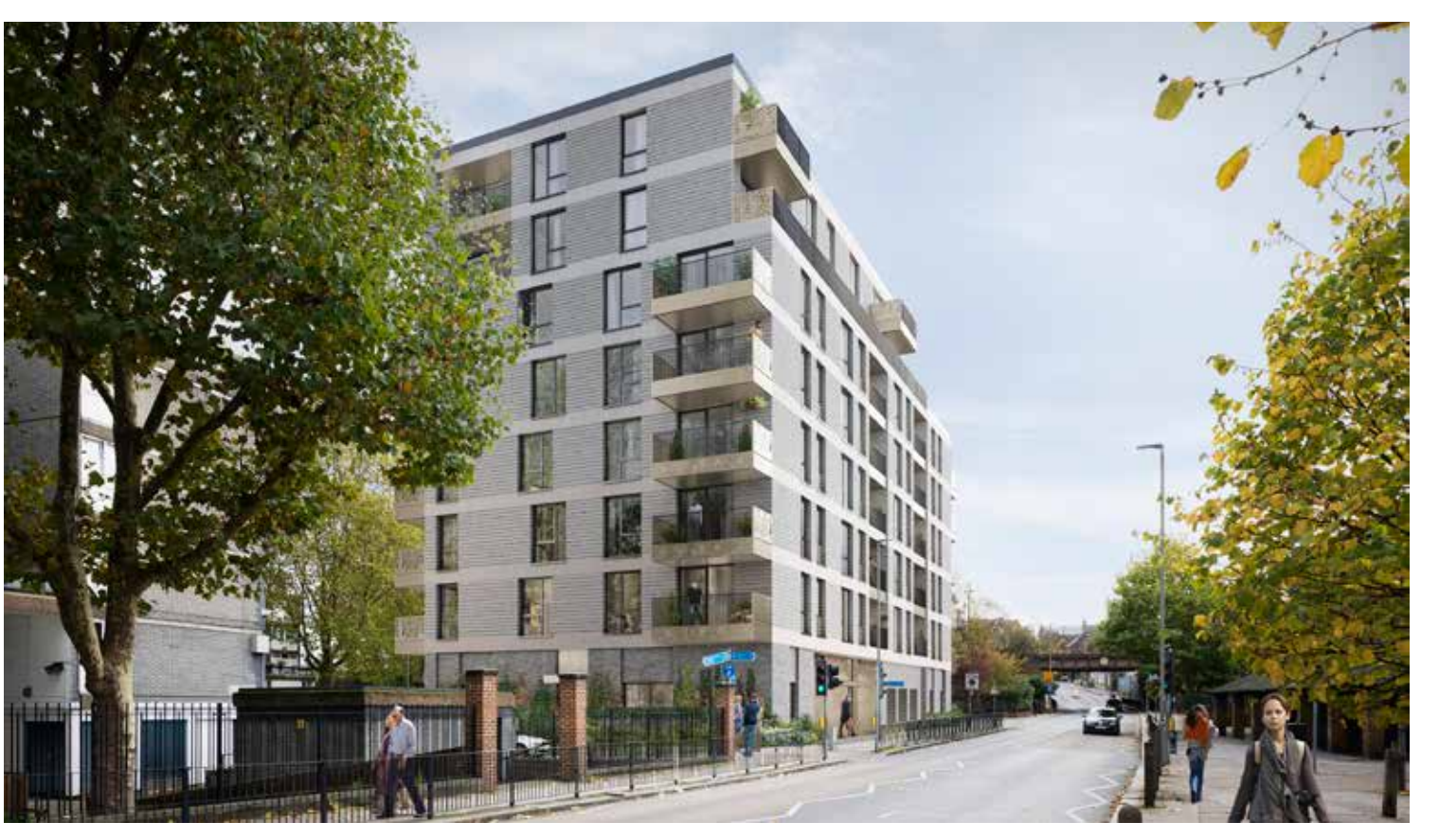
View looking north along Plough Road, Block A

Land bounded by Grant Road, Winstanley Road, Thomas Baines Road and Plough Road