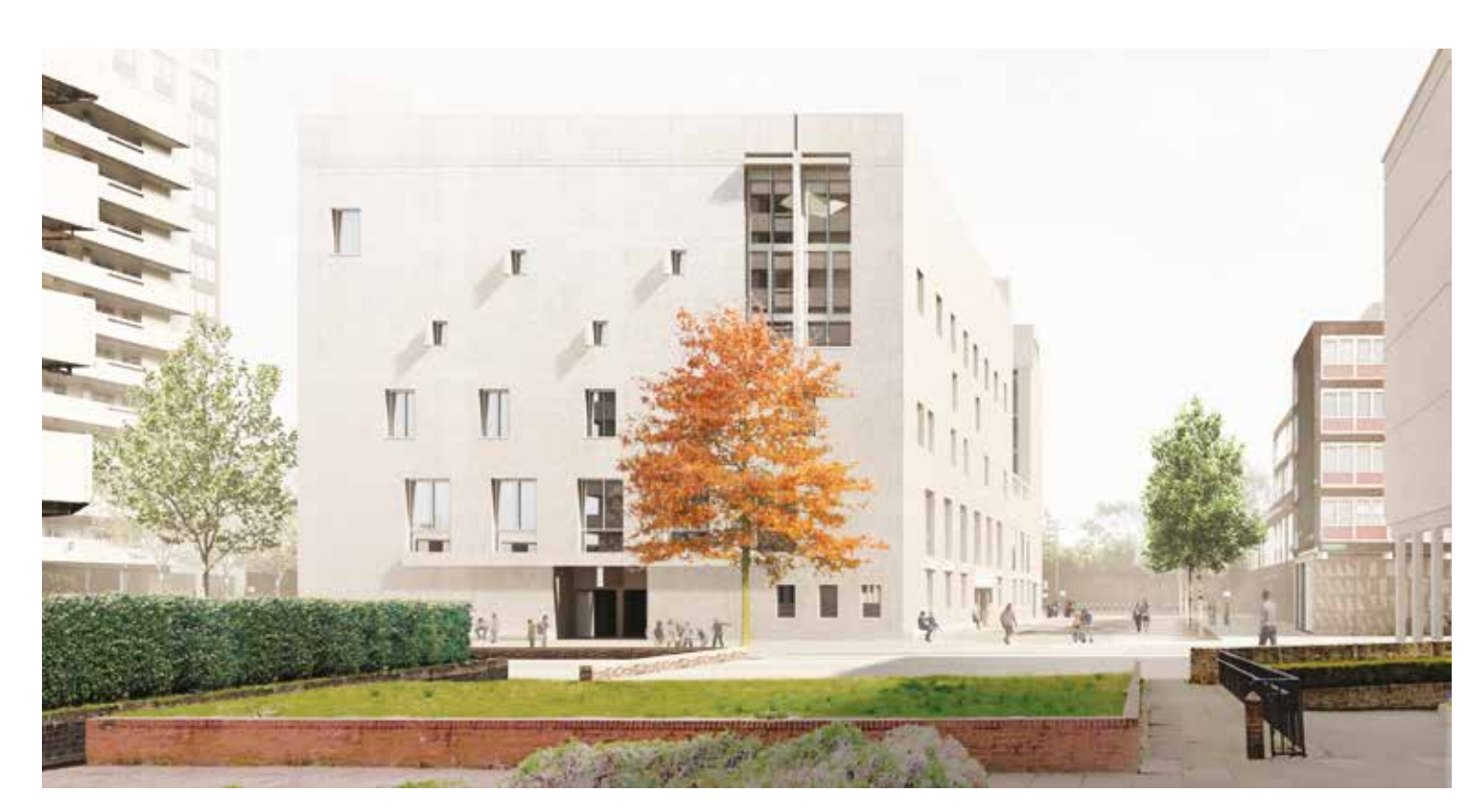
View looking south towards the Battersea Baptist Chapel, Block B.