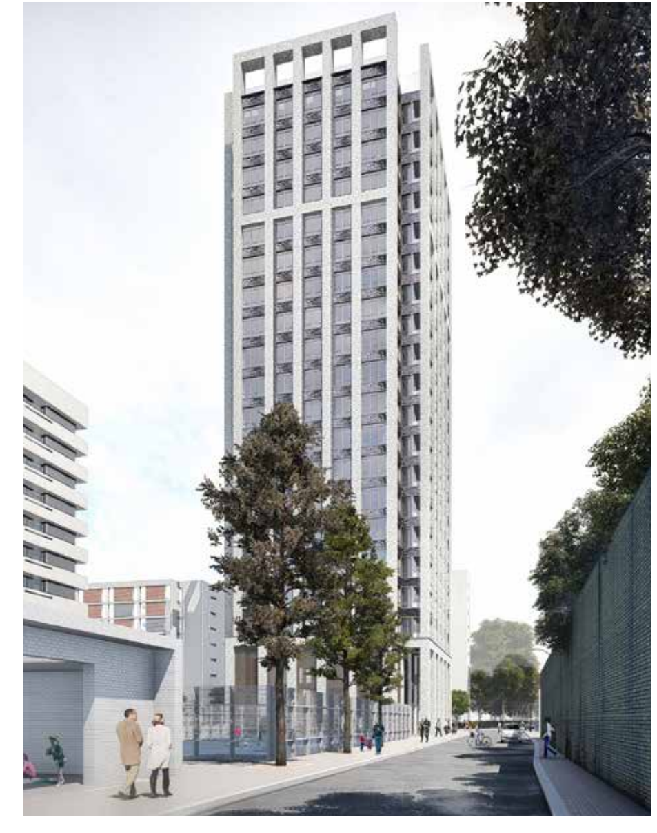
View looking east along Grand Road towards the proposed MUGA and residential tower, Block C.

The design of the new buildings and public spaces are designed to complement the existing estate and to create a new high quality architecture. A new 20 storey residential tower is located on the junction of Winstanley and Grant Road (Block C).