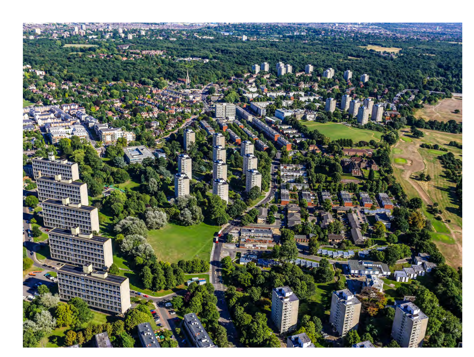
Alton West from the west, 2017, showing later trees and buildings