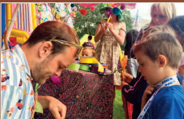
Roehampton Outdoor Art Movement

Both of the free-to-attend events were funded by local sponsors including Wandsworth Council.