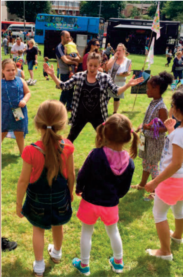
Roehampton Outdoor Art Movement

Roehampton Outdoor Art Movement (ROAM) ran a creative zone of activities including dance workshops, puppet making, storytelling, and comedy.