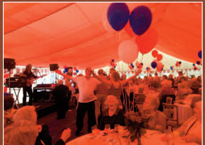
Kings and Queens event

Sunday 3 July saw around 500 people turn out for the Feel Good Festival, also on Danebury Avenue Green, and organised by Portswood Place-based charity Regenerate. Local residents enjoyed a mix of arts and sports, including circus skills, along with face painting, live music, food and drink, and a mini funfair.