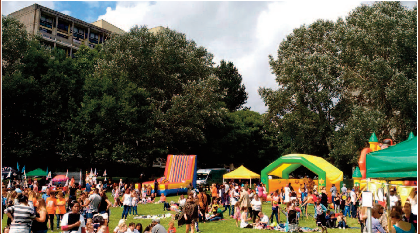
Feel Good Festival