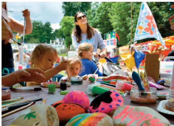
ROAM's creative zone at the Feel Good Festival on 3 July