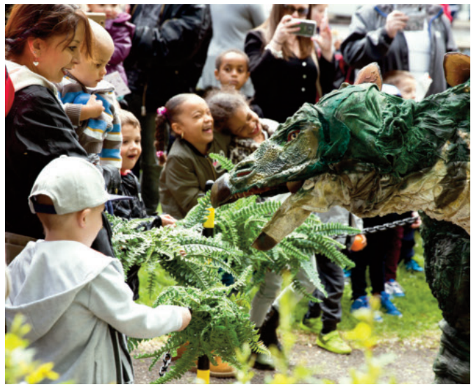
A previous ROAM event