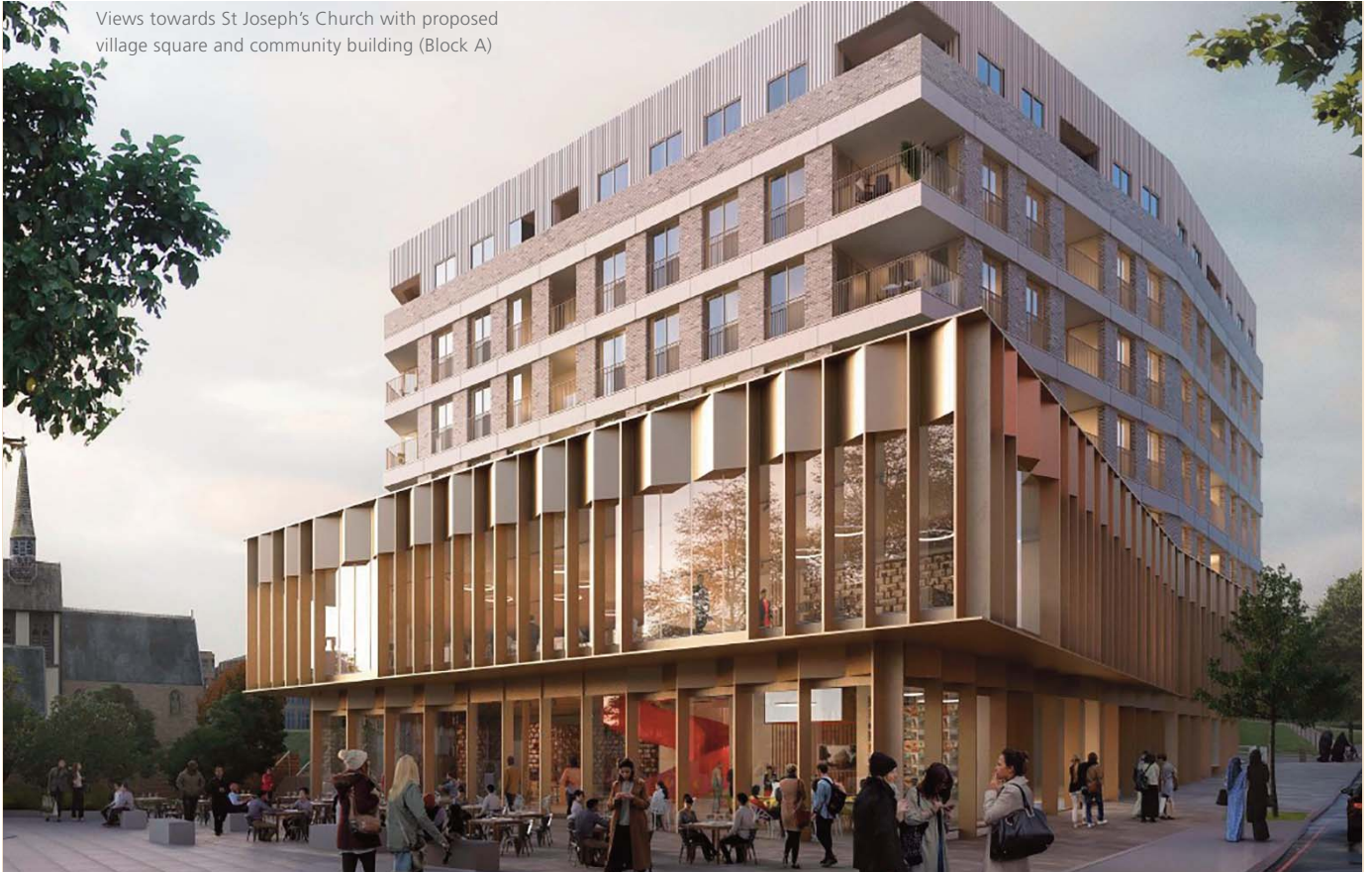
Views towards St Joseph's Church with proposed village square and community building (Block A)