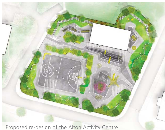
Proposed re-design of the Alton Activity Centre

the new turnaround and nearby blocks, and that the new turnaround would be obscured by mature, evergreen landscaping. Wider concerns raised about parking are shared across the estate, and a range of measures to improve the management of parking will be included in the Travel Plan which will be submitted as part of the planning application.