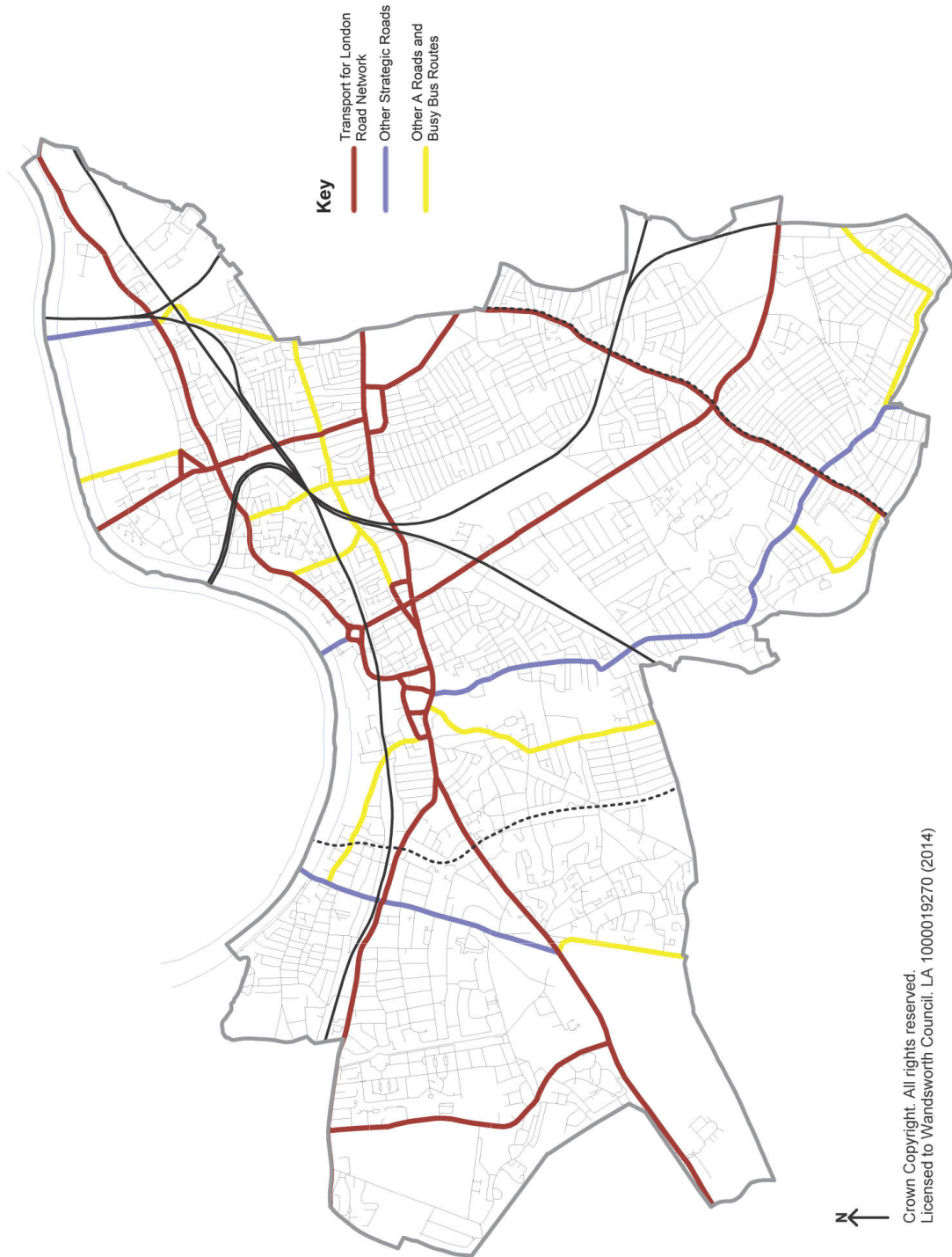
Map 2 Strategic Road Network

Crown Copyright. All rights reserved. Licensed to Wandsworth Council. LA 1000019270 (2014)