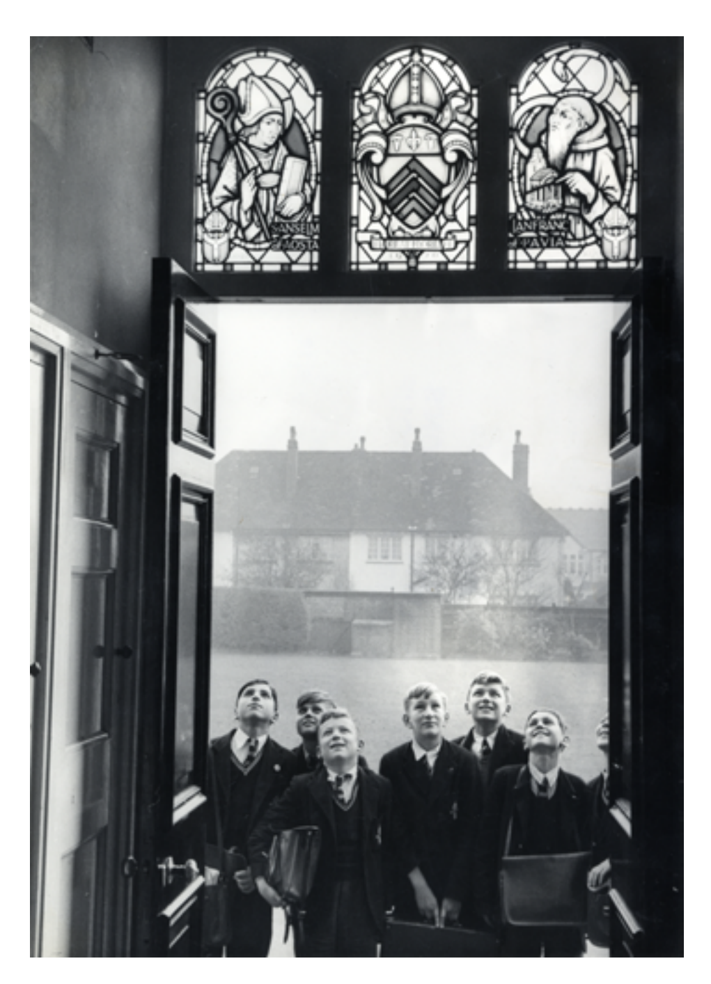
Bec School Tooting boys looking at stained glass window, 1955