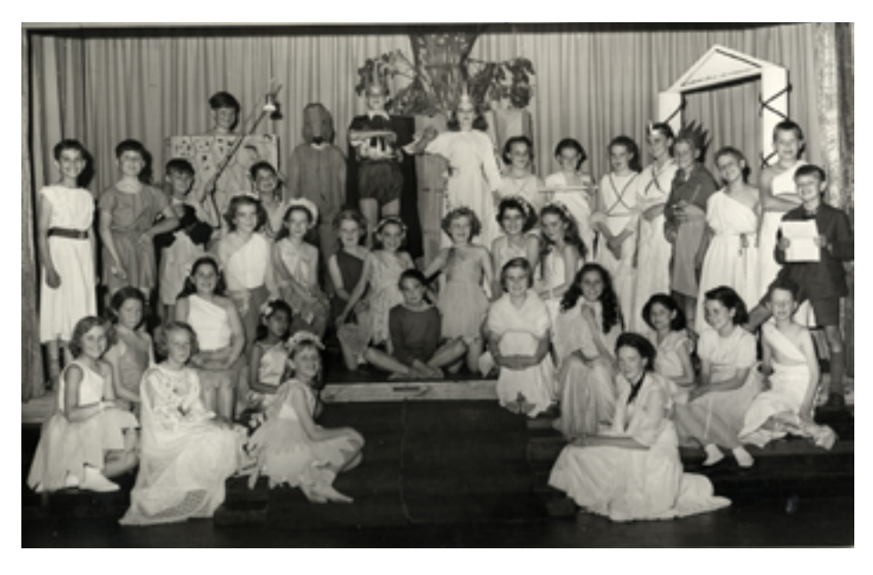
West Hill School Production of 'A Midsummer Night's Dream', c1955