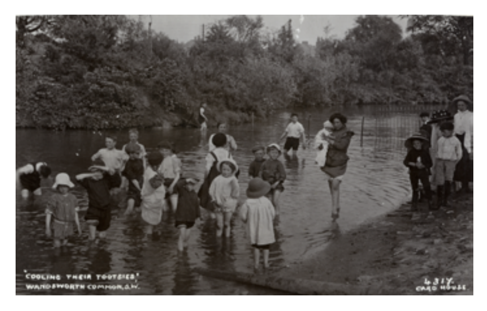
Children 'cooling their tootsies' on Wandsworth Common