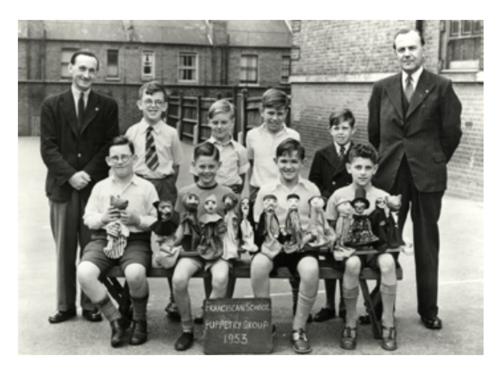
Franciscan School Puppetry Group, 1953