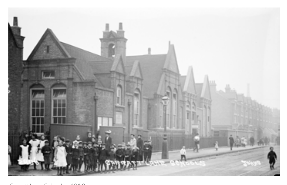
Garratt Lane Schools, c1910s