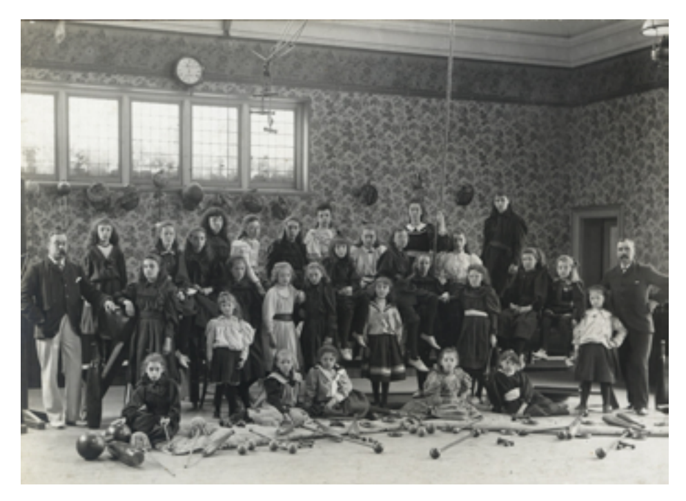
Putney High School pupils in gymnasium, c1890