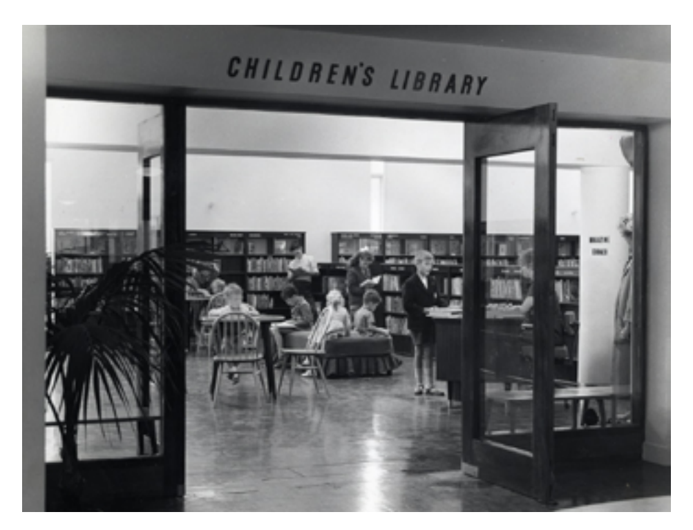
Roehampton Children's Library, c1961