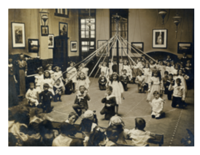
Children in Sellincourt Road School dancing round the maypole