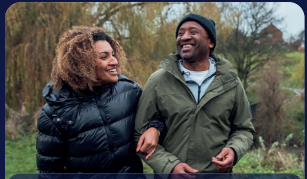
Be active for at least 22 minutes, every day of the week

We are out and about in the borough encouraging residents to have fun, be active and stay healthy. Here are some of the things you can do.