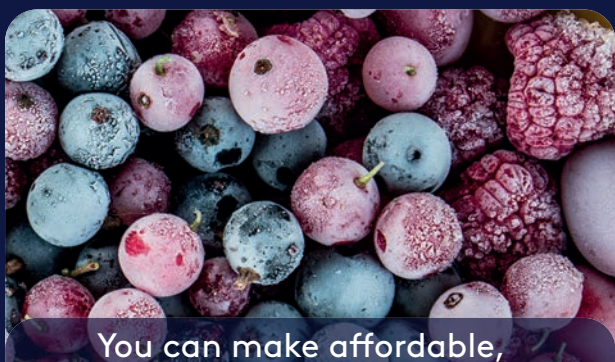
You can make affordable, budget friendly food swaps to help remain healthy

For tips and advice to stay healthy, visit wandsworth.gov.uk/healthylifestyle