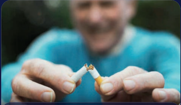
Get advice to stop smoking You are 4 times more likely to quit