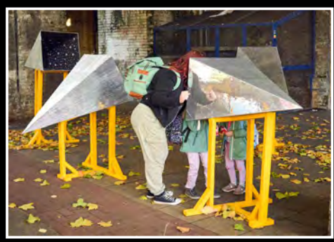
The Deconstructed Disco.

also joined the team of local people recording their night time experiences to create a playlist for a second creative project, Sounds of the Borough.