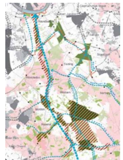
Boundary of Wandle Valley Regional Park in All London Green Grid