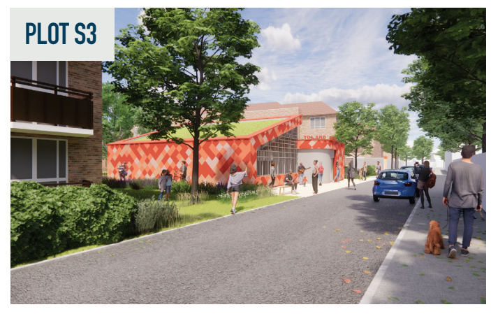
Indicative image showing the proposed massing of the re-provided community clubroom (plot S3) from street view.