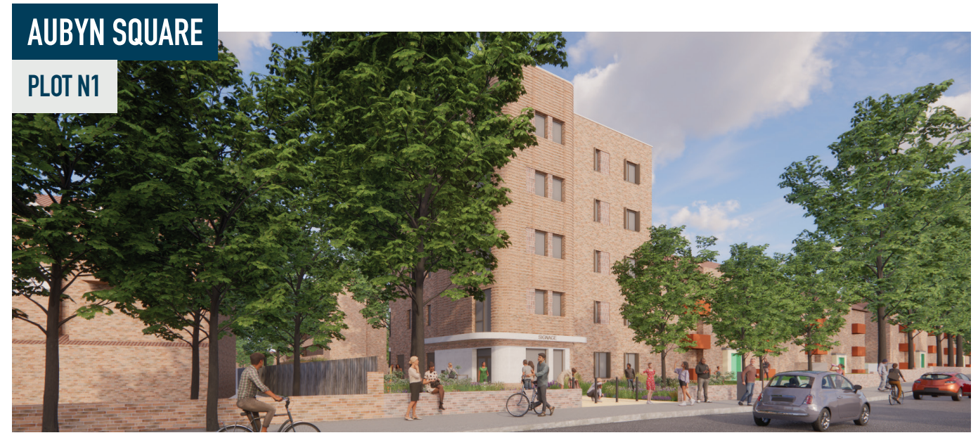
Indicative image showing the proposed plot N1 street view.