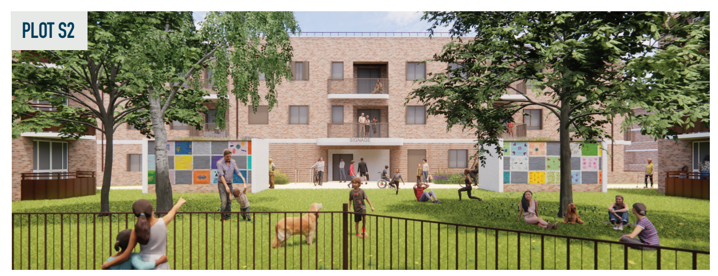
Indicative image showing the proposed plot S2 south elevation.