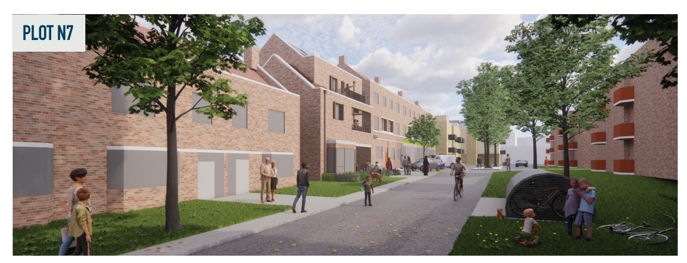
Indicative image showing the proposed plot N7 street view.