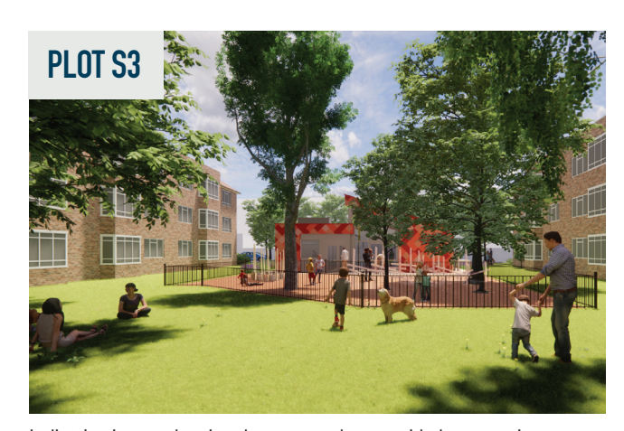
Indicative image showing the proposed re-provided community clubroom (plot S3) view from the back of the green area between Cline and Reed House.