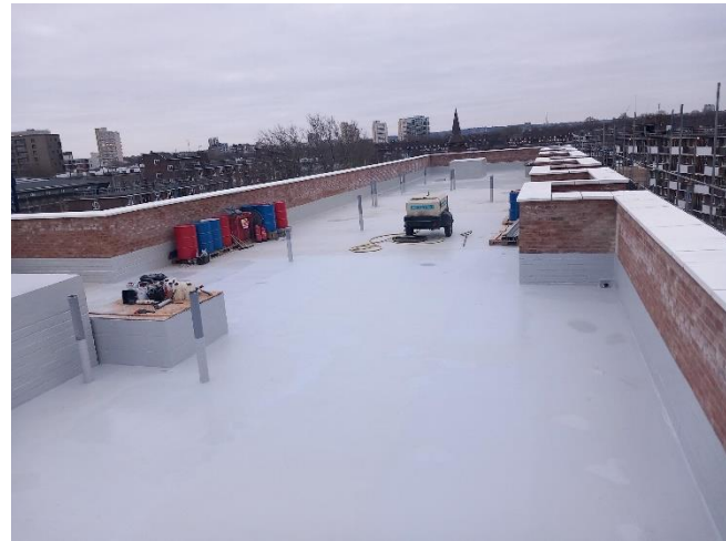
Completion of waterproofing to roofs of Blocks B & C

Helena O'Keeffe Resident Liaison Officer Mobile : 07706 350 588