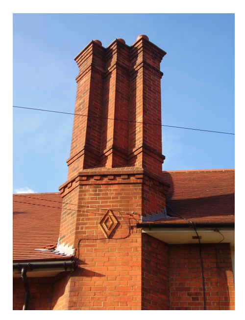
Tudor - style chimney

1.19 There are three basic roof shapes used throughout the Estate. Firstly there is the conventional hipped roof, sometimes with projecting heavy gables, sometimes with a hipped end; secondly some cottages have a distinctive roof with eaves at first floor level with dormer windows at the side of the cottage - with this roof type, the ends of a group are sometimes finished with a half hip to link with the two-storey rear of the cottage; and thirdly some cottages have distinguishing double-pitched front gabled roofs - a notable feature is the prominent projection at the eaves with no visible fascia. Tudor-style chimneys are introduced to punctuate the roofscape; dramatically styled ones are used usually at the end of a group.