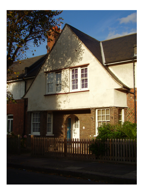
Double pitched front gabled roof in the middle of a terrace