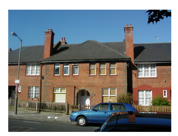
Picture 2.2 Replacement windows take away from the special character of the terrace