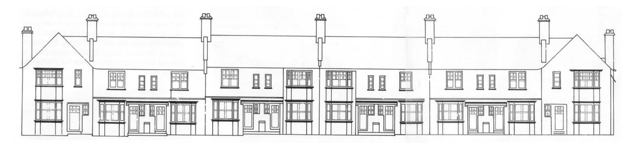
Figure 2.1 Every individual house within a terrace was designed so that the whole terrace would be seen as one large building