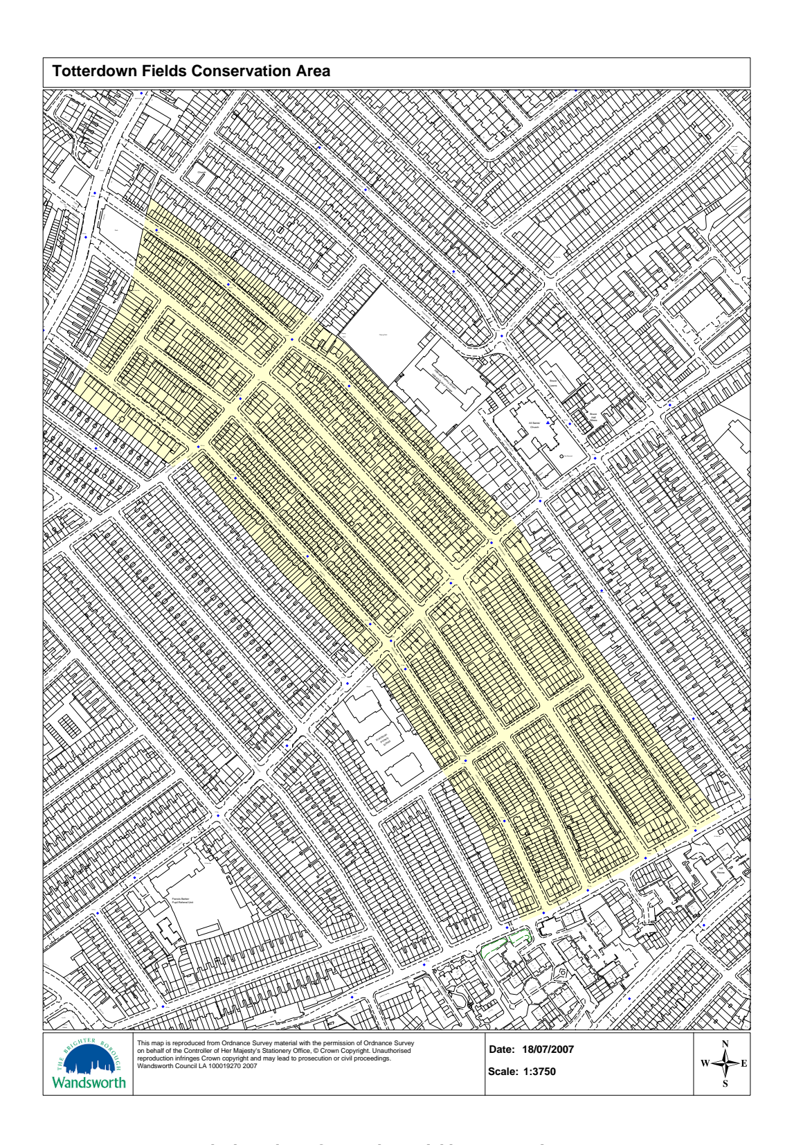
The boundary of Totterdown Fields Conservation Area