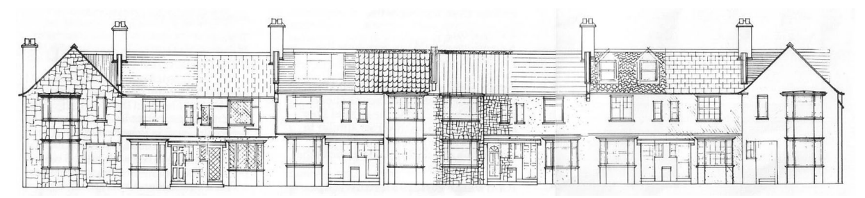
Figure 2.2 Altering the appearance of individual houses alters the appearance and design of the whole terrace and looks unattractive