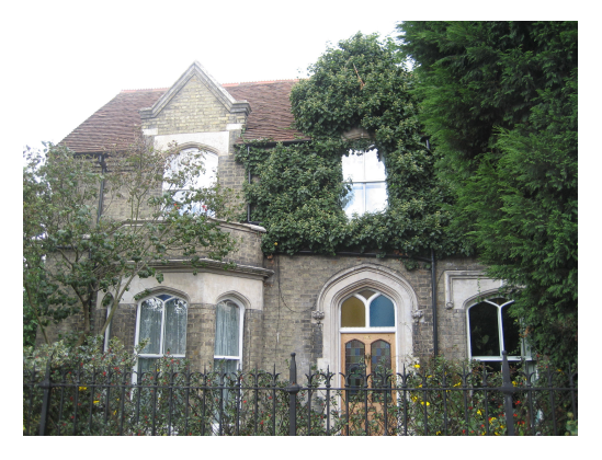
Picture 8 Park Lodge seen from Atney Road. This is the 1871 extension

6.1 Park Lodge dates from the late 17th century or early 18<sup>th</sup> century and was substantially extended to in 1871. The oldest part of the house fronts onto Putney Bridge Road and the later extension fronts on to Atney Road. The oldest part of the house represents a surviving example of a timber and brick building. It is constructed in red and brown brick using an interesting mix of bonds that includes Flemish and English Cross. It has been painted but much the paint has rubbed off revealing areas of the original brick work. Elevationally, the building is of mid 19<sup>th</sup> century appearance with Tudor arched heads to