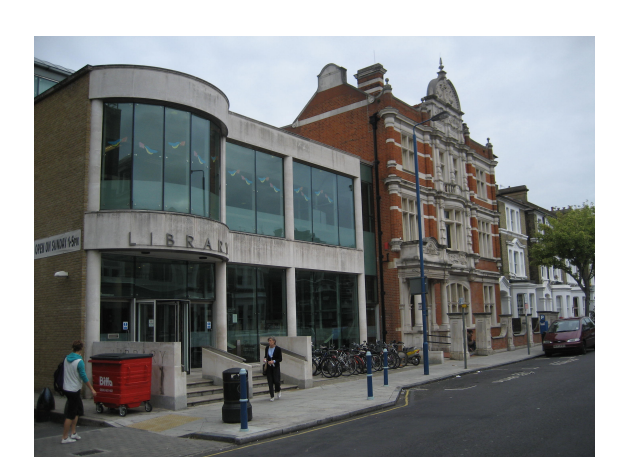
Picture 10 Newnes Public Library to the right, with the new extension seen on the left.