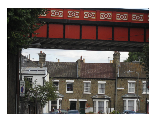
Picture 5 The District Line Bridge forming in places the eastern boundary of the conservation area

4.3 Front gardens and street trees provide an important green element to this conservation area. There are generous front gardens especially along Oxford Road.