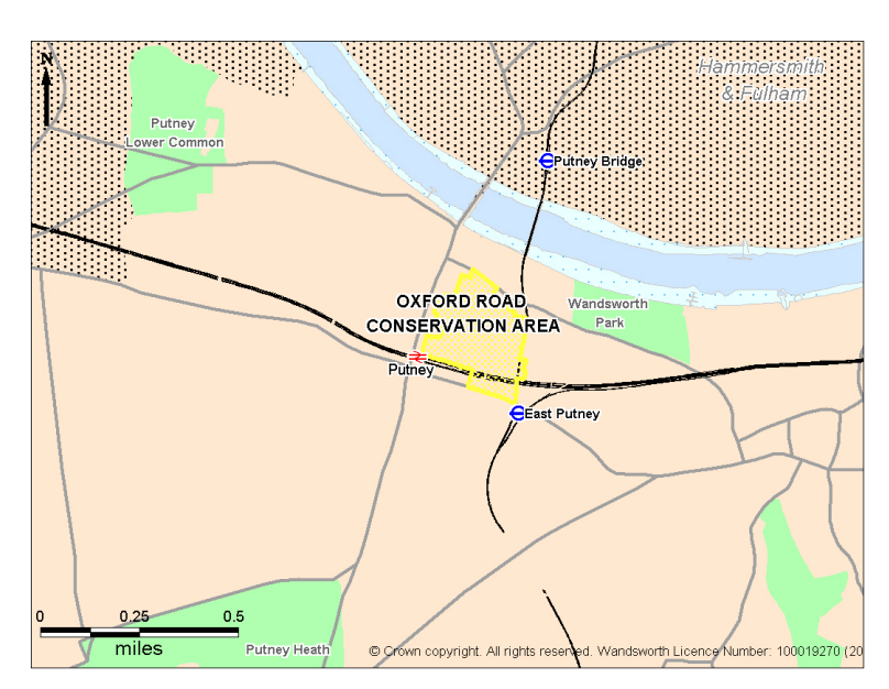
Map 2 Location Map

2.1 The conservation area runs parallel to the Putney High Street, Putney's commercial heart. It is also connected to Putney Bridge Road to the North and the Upper Richmond to the South. Good transport links with both East Putney Underground Line and Putney Station in easy walking distance.