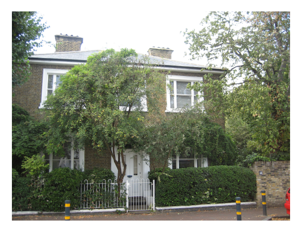
Picture 6 One of three at the corner of Disraeli Road and Oxford Road

5.9 On three of the corners on the junction of Disraelli Road and Oxford Road, it looks as if a fourth house should be where the Putney School of Art now sits but it was never built.