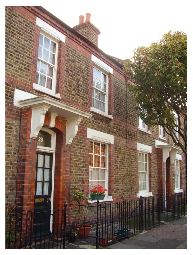
Picture 4 Projecting canopy over the front door. Timber sliding sash windows

segmental arch. Roofs are covered with Welsh slate capped with red terracotta ridge tiles. Houses on the earliest part of the Estate, south of Burns Road, have narrow forecourts, which were originally defined by cast metal railings. These were removed during the Second World War leaving no boundary to the footway. The houses erected later in Reform Street have larger windows and the same roof and wall treatment but lack the robust moulded window heads and entrance canopies. These are simpler cottage style houses and this theme is carried through on the north side of the recreation ground where houses lie behind small front gardens bounded by timber fences and privet hedging.