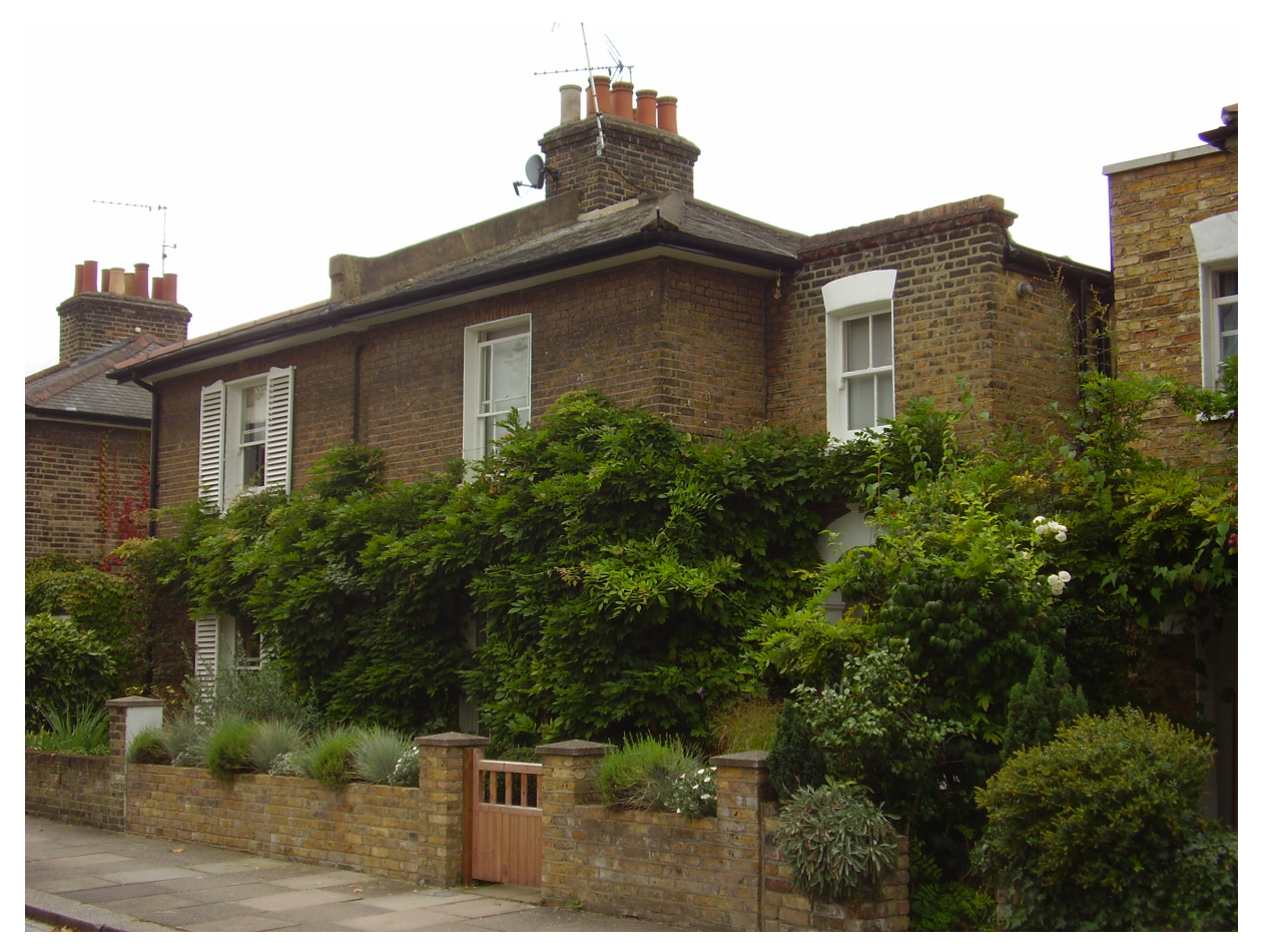
Figure 6 Well planted front gardens

6.1 There are no street trees on the west side of the road and indeed few large garden trees apart from the large gardens of nos.50/52. This contrasts with the east side of the road which has a row of Plane trees typical of the late 19th Century suburban layout of the area. Front gardens however bring a wealth of green to the conservation area.