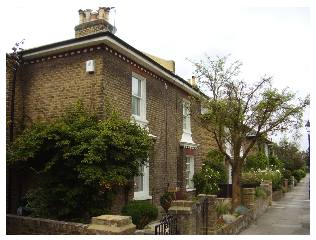
Figure 2 Houses in Coalecroft Road

1.1 The special character of this conservation area is derived from the pairs of small early Victorian farm workers cottages lining a narrow street maintaining a different identity to the latter residential development that surrounds it.