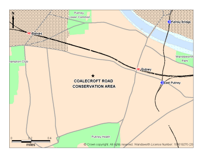
Figure 3 Map showing the location of Coalecroft Road Conservation

2.1 The Conservation Area sits south of the Upper Richmond Road 1/3 miles away from Putney Town centre with transport links into central London.