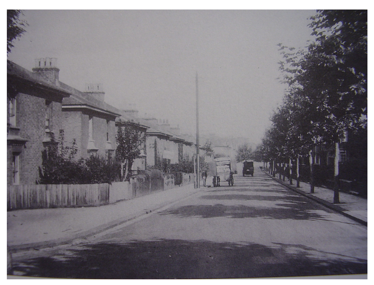
Figure 5 Photograph showing Vinegar Hill in the 1930s