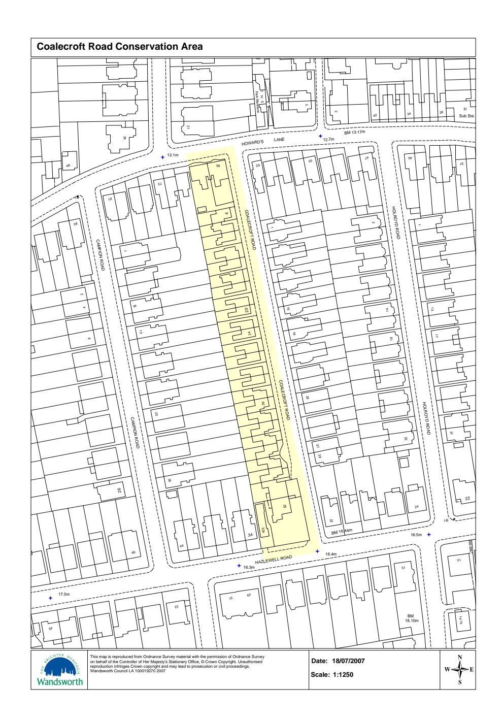
Figure 1 The boundary of the Coalecroft Road Conservation Area. The conservation area is surrounded on all sides by the much larger West Putney Conservation Area.