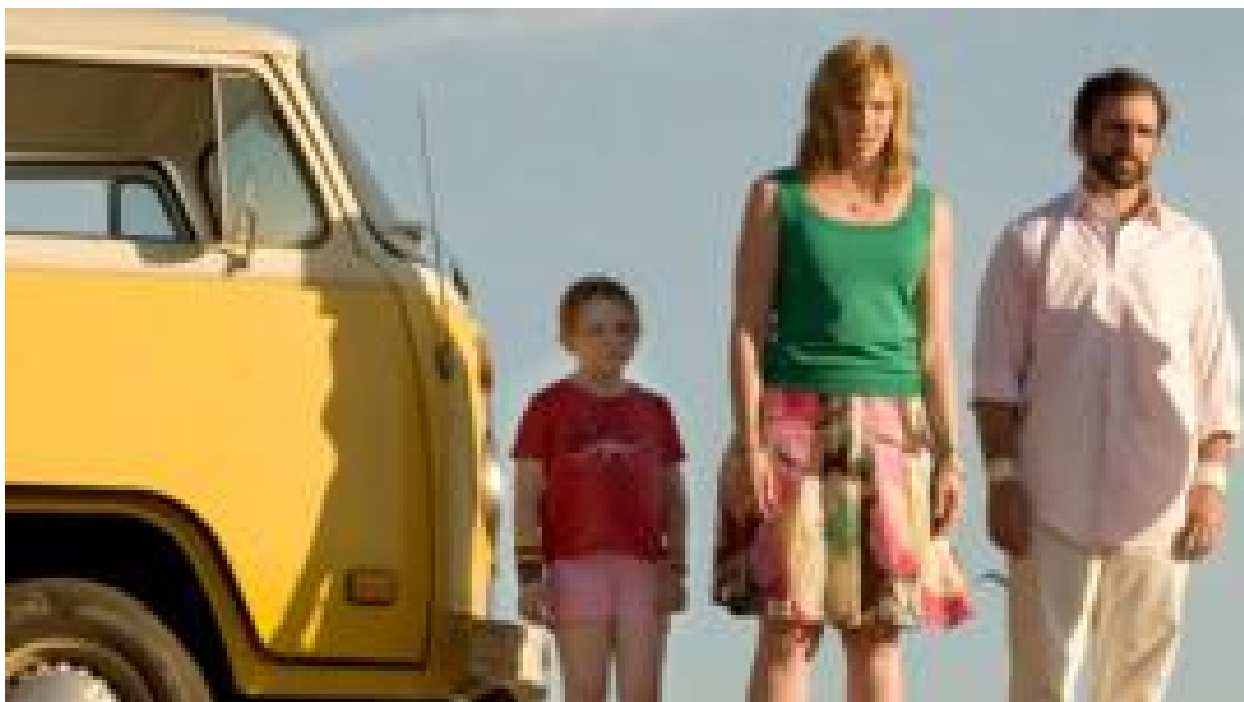
Is this the secret to making an Oscar winner?