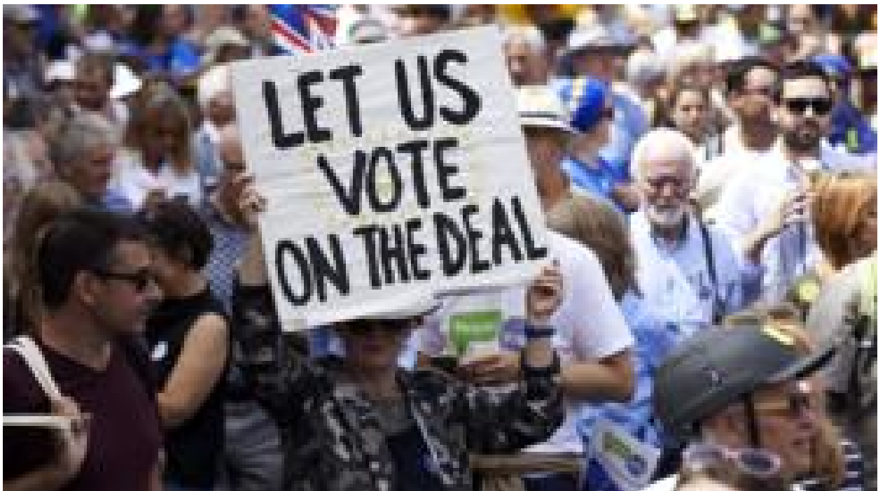
How Europe does second referendums