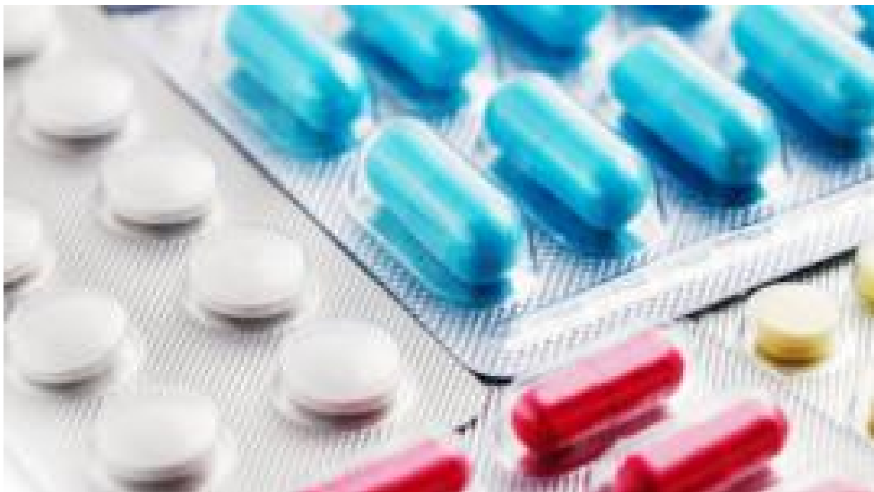
Is NHS finding it hard to get medicines?