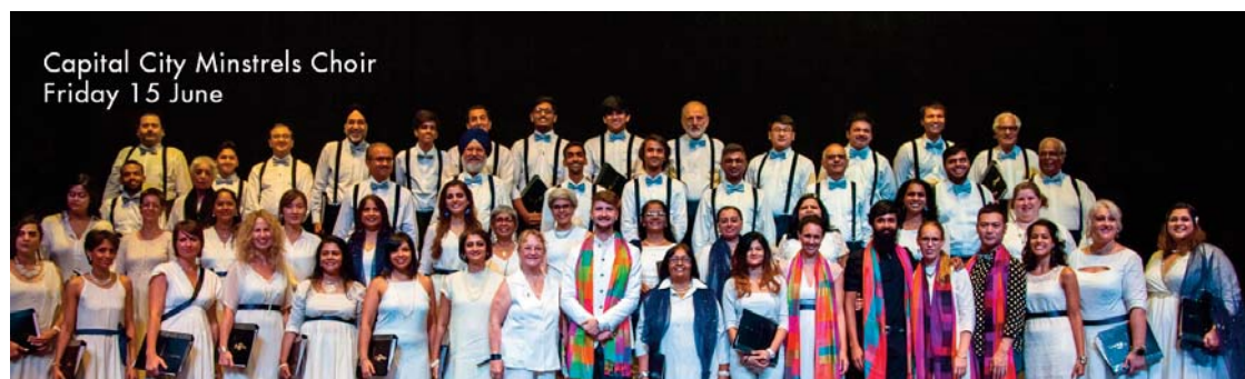
Capital City Minstrels Choir Friday 15 June

Community event includ- ing live music, dance and entertainment, stalls, food and drink and children's entertainment. There will also be a big screen show- ing the Wimbledon Men's Finals. northcoteroad.london