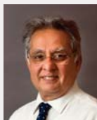
Ravi Govindia Conservative Leader of the council