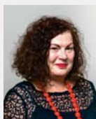
Leonie Cooper Labour