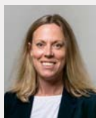
Candida Jones Labour Deputy Leader of the Opposition (Non-Statutory)