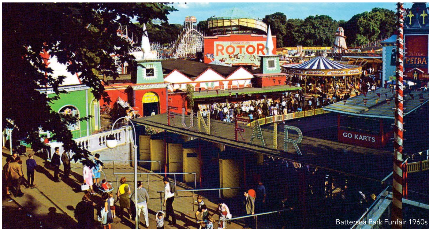
Battersea Park Funfair 1960s