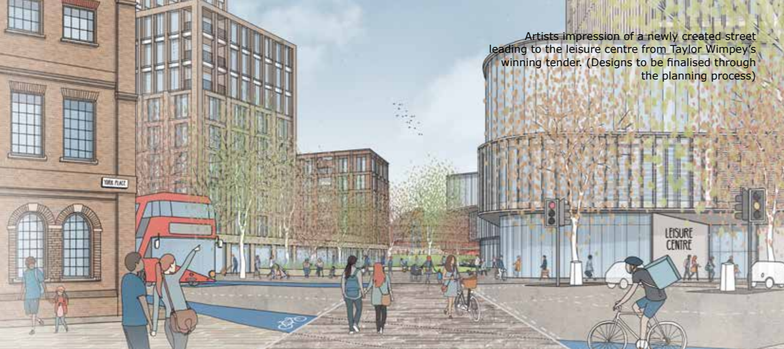
Artists impression of a newly created street leading to the leisure centre from Taylor Wimpey's winning tender. (Designs to be finalised through the planning process)