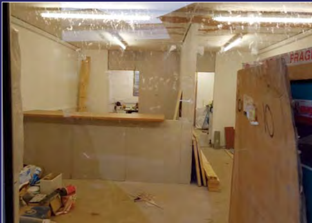
Work continues on the new project office

To discuss your options come to our drop-in sessions or call the regeneration team today. More information on the council's rehousing commitments can be found at www.wandsworth.gov.uk/winstanleyyorkroad .