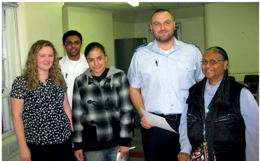
Neighbourhood Watch meeting

Community Safety Division to explore whether it will be possible to include a Neighbourhood Watch category in the council's Volunteer of the Year Awards